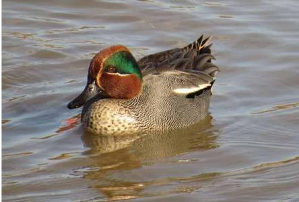
Teal at East India Dock Basin

3 December 2015 East India Dock Basin: a Redwing in the Copse, 1 Kingfisher, 10 Shelducks, 54 Teal, 6 Tufted Ducks (Tom Speller).