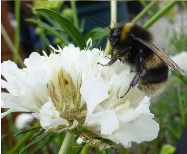
The leafcutter bee Megachile ligniseca (top), Brown-banded Carder Bee (middle) & Buff-tailed Bumblebee at Spitalfields City Farm.