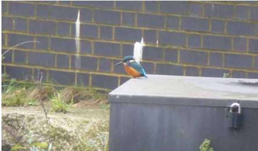
Kingfisher at East India Dock Basin

5 January 2015, Limehouse Basin: 8 Tufted Ducks (Martin Ling).