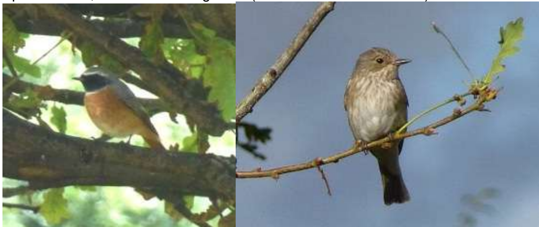
Male Redstart (left) and Spotted Flycatcher at Mudchute

27 August 2015, Mudchute: 1 Pied Flycatcher, 2 male Redstarts, 4-5 Spotted Flycatchers, 1 Willow Warbler, 5+ House Martins, 1 Great Spotted woodpecker, 1 Sparrowhawk, 1 Red Underwing moth (Ian Stewart & John Archer).