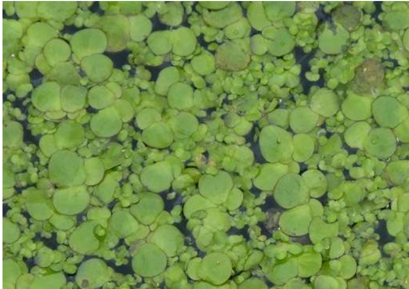
Greater Duckweed (with Lesser and/or Least Duckweed) on the Regent's Canal