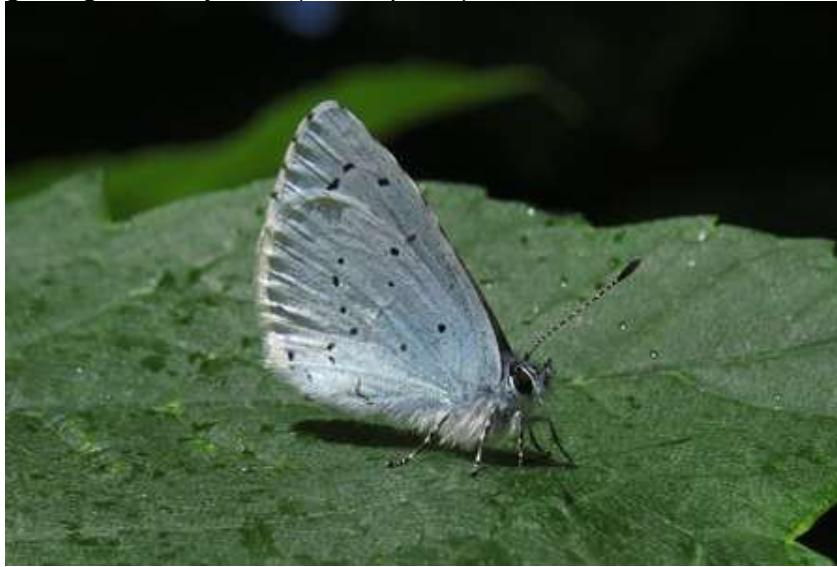
Holly Blue at East India Dock Basin

29 May 2015, Bow Creek: 2 Egyptian Geese, a pair of Canada Geese with 5 goslings, 1 Holly Blue (Tom Speller).