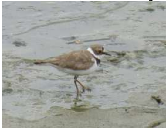
Little Ringed Plover at East India Dock Basin

14 July 2015, East India Dock Basin: at least 8 Common Tern chicks (3 broods of 2 and 2 more broods of at least one), plus a fledged juvenile (probably not bred here) and about 15 adults, 2 adult Little Ringed Plovers, 5 Tufted Ducks (John Archer).