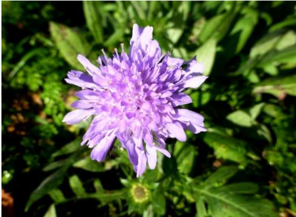
Field Scabious at East India Dock Basin (photo: John Archer)

16 January 2015, Tower Hamlets Cemetery Park: the Firecrest again in Monument Glade, 2+ Goldcrests, several Ring-necked Parakeets prospecting a nest box (Bob Watts).