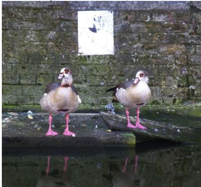
Egyptian Geese on the Wapping Canal

28 September 2015, Wapping Canal: 2 Egyptian Geese, 3 Mute Swans (2 adults and a first winter), 4 Canada Geese, 2 Coots, 51 Mallards, 1 Jay (John Archer).