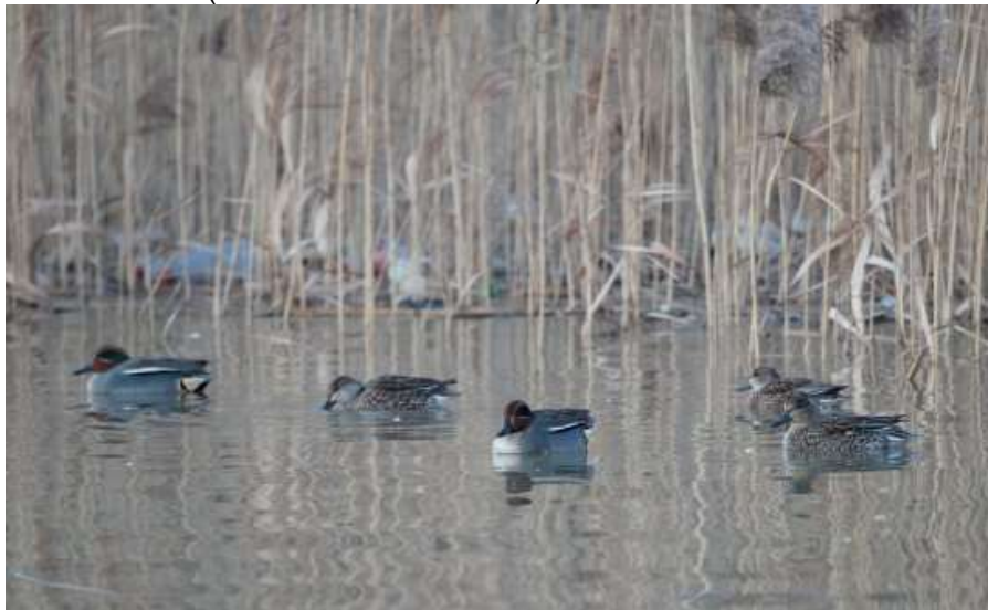
Teal at East India Dock Basin

24 January 2015, East India Dock Basin: 169 Teal, about 15 Shelducks, about 30 Tufted Ducks (David Darrell-Lambert).