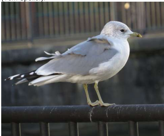
Common Gull at Millwall Inner Dock (photo: Tom Speller)

4 December 2015, Millwall Inner Dock: a Common Gull with Black-headed Gulls (Tom Speller).