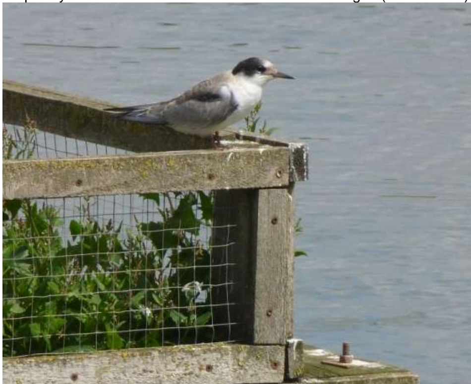
juvenile Common Tern at East India Dock Basin

6 August 2015, East India Dock Basin: another 2 of the Common Tern chicks have fledged and are flying around the basin with one of the older juveniles, returning frequently to the raft. Just 2 more chicks remain unfledged (John Archer).