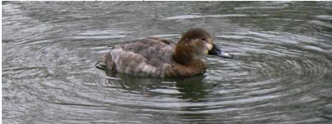
Female Pochard in Victoria Park

19 February 2015, Victoria Park: 5 Red-crested Pochards (3 drakes and 2 females), 1 drake Shoveler, 4+ Gadwall, lots of Pochards and Tufted Ducks, 4 Egyptian Geese, 5+ Stock Doves (John Archer).