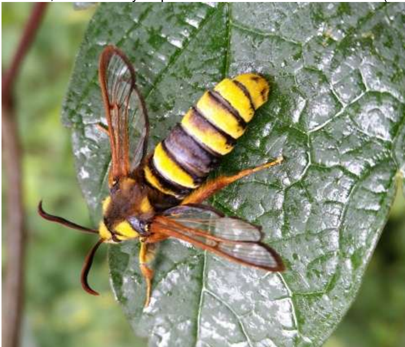
Hornet Moth at Ackroyd Drive Green Link (photo: Ken Greenway)

19 June 2015, Ackroyd Drive Green Link: a Hornet Moth, which is very rare in London, around Grey Poplars close to Bow Common Lane (Ken Greenway).