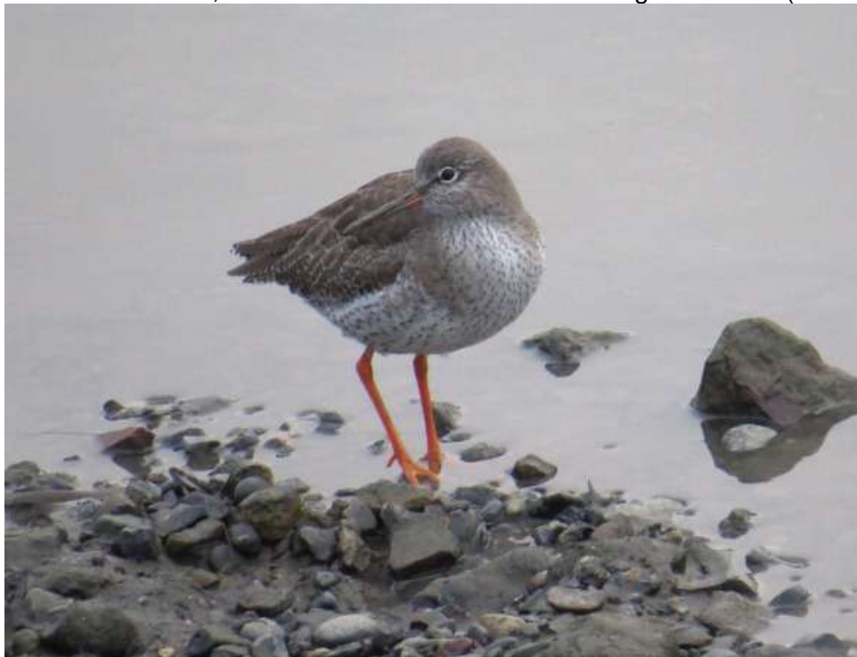
Redshank at Bow Creek

3 December 2015, Bow Creek: 33 Redshanks in the high tide roost (Tom Speller).