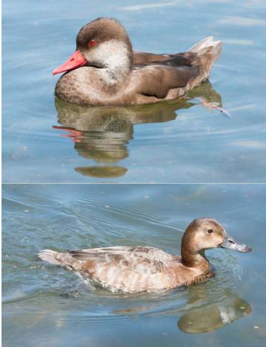
Red-crested Pochard (top) and Pochard

4 July 2015, Victoria Park: 28 species of birds including 10 Sand Martins, 10 Swifts, 1 Red-crested Pochard, 4 Pochards, 20 Tufted Ducks, 50 Coots, 3 Stock Doves, 5 Ring-necked Parakeets, 1 Jay, 2 Goldcrests, 1 Great Spotted woodpecker (David Darrell-Lambert and participants on the Bird Barmy Army walk).