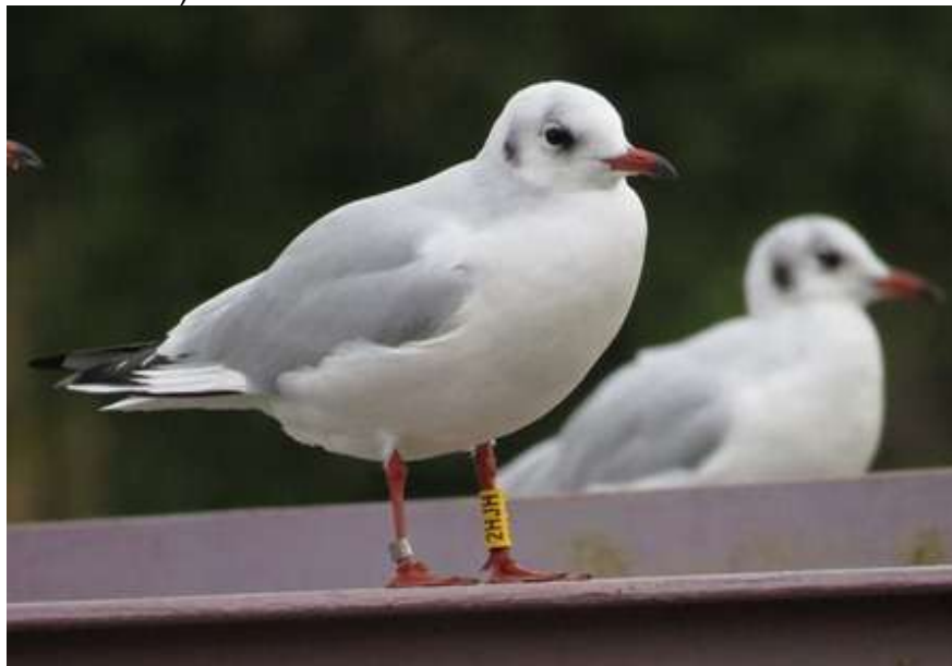
Colour-ringed Black-headed gull "yellow 2HJH"

9 November 2015, East India Dock Basin: 1 Kingfisher, 1 Sparrowhawk, 1 Little Grebe, 1 Chiffchaff, 2 Canada Geese, about 120 Teal, 1 Grey Wagtail, 3 Grey Herons, 22 Cormorants on the pier, also a Black-headed Gull colour-ringed by the North Thames Gull Group at Rainham Marshes in January 2015 – the movements of this gull can be tracked on the North Thames Gull Group website (Tom Speller & John Archer).