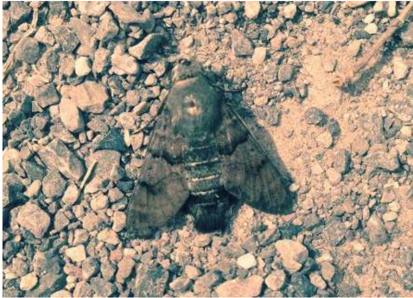
Hummingbird Hawk-moth in Scrapyard Meadow.

8 August 2015, Victoria Park: 2 Pied Flycatchers near the Sunken Garden (Brian Gee).