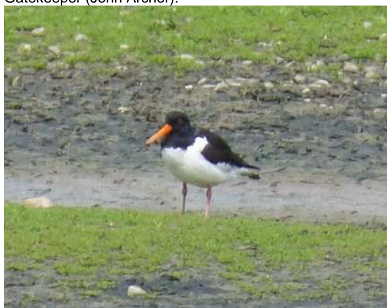
Oystercatcher at East India Dock Basin

18 May 2015, East India Dock Basin: 1 Oystercatcher roosting on the island. 1 Kestrel, 1 Swallow flew west, 1 Sand Martin, 6+ Common Terns but none appear to be incubating, 3 Shelducks, 4 Tufted Ducks, 1 Blackcap singing, 1 Reed Warbler singing, 1 abnormally small Red Admiral butterfly about the size of a Gatekeeper (John Archer).