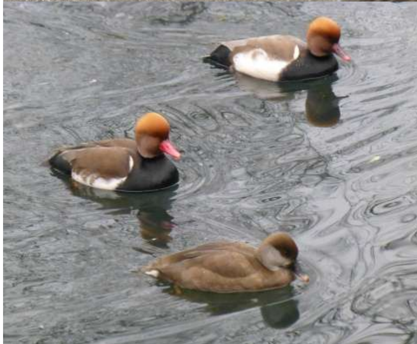
Hybrid Canada x Greylag Goose (above) and Red-crested Pochards