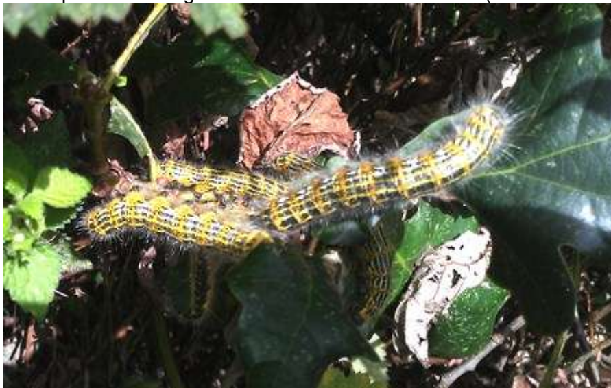
Buff Tip caterpillars at Mudchute

28 August 2015, Mudchute: the Pied Flycatcher, 2 male Redstarts, at least 3 Spotted Flycatchers and a Willow Warbler still in the paddocks, 1 Sparrowhawk, 1 Great Spotted Woodpecker (Sean Huggins & Paul Hyland). Also several caterpillars of the Buff Tip moth feeding on oaks south of the allotments (Peter Minvalla).