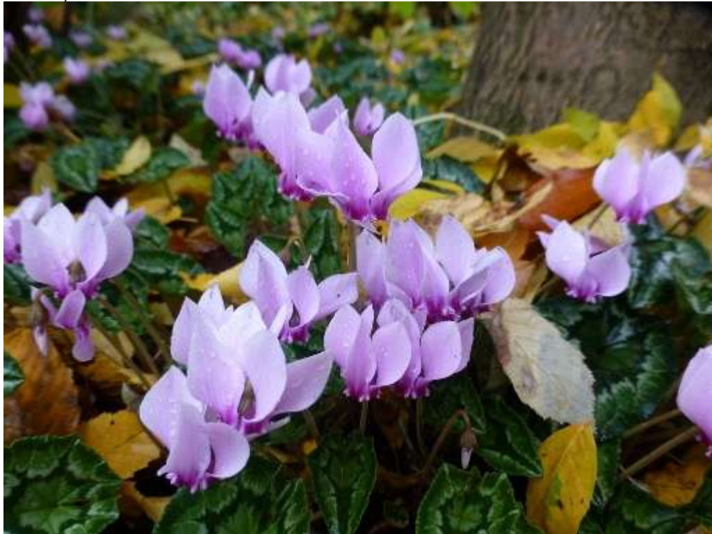
Cyclamen at Bethnal Green Nature Reserve

2 November 2015, Bethnal Green Nature Reserve: lots of Cyclamen in flower (John Archer).