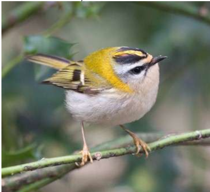
Firecrest in Cemetery Park

4 March 2015, Tower Hamlets Cemetery Park: the Firecrest still singing and showing very well in Sanctuary Wood this morning and a Song Thrush singing (David Darrell-Lambert & Bob Watts).