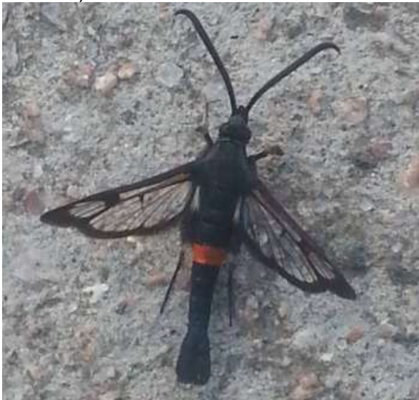
Red-belted Clearwing on Sycamore Avenue (Kirsty Kelleher)

21 June 2015, Sycamore Avenue E3: a Red-belted Clearwing moth in the street (Kay Kelleher).