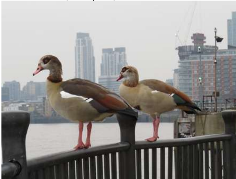
Egyptian Geese at East India Dock Basin

11 February 2015, East India Dock Basin: 2 Egyptian Geese, 2 Shelducks, 23 Tufted Ducks, c70 Teal (Tom Speller).