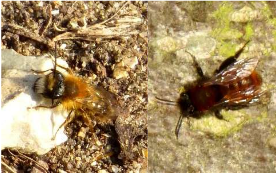
Male (left) and female Tawny Mining Bees at East India Dock Basin (John Archer)

7 April 2015, Saffron Avenue Pond: 2 pairs of Coots with 3 and 2 small chicks respectively (John Archer).