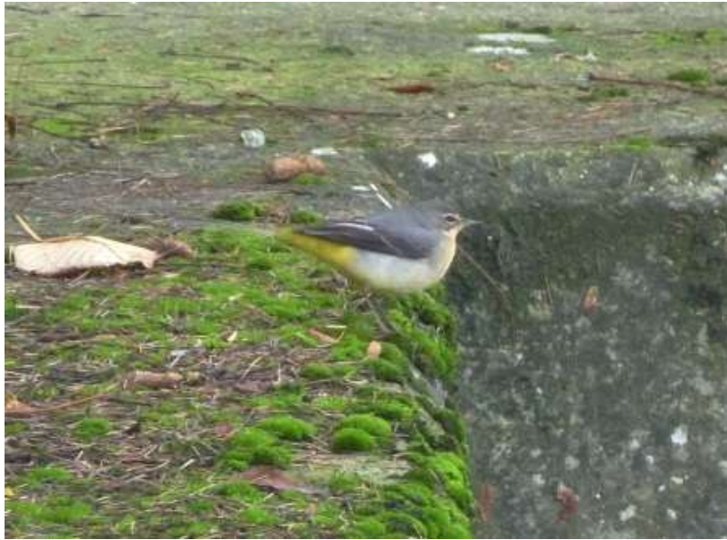
Grey Wagtail at East India Dock Basin

7 October 2015, Tower Hamlets Cemetery Park: 1 Coal Tit, 2 Chiffchaffs, 4+ Goldcrests but no sign of any Firecrests (Bob Watts).