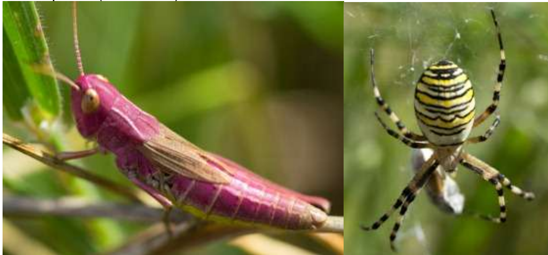
Pink-morph Meadow Grasshopper (left) and Wasp Spider at Mudchute (photos: Justine Aw)

15 August 2015, Mudchute: a Wasp Spider eating a Roesel's Bush-cricket, and a Meadow Grasshopper nymph of the uncommon pink colour-morph, all near the wildlife ponds (Justine Aw).