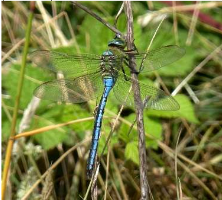
Emperor Dragonfly at East India Dock Basin

18 June 2015, East India Dock Basin: 12+ Common Terns, with about 6 incubating, 2 Egyptian Geese, 3 Shelducks, 4 Tufted Ducks, 1 Mute Swan, 2 Emperor Dragonflies (John Archer).