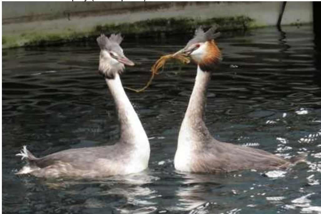
Great Crested Grebes displaying

23 October 2015, Blackwall Basin: a pair of Great Crested Grebes performing their "weed dance" display.