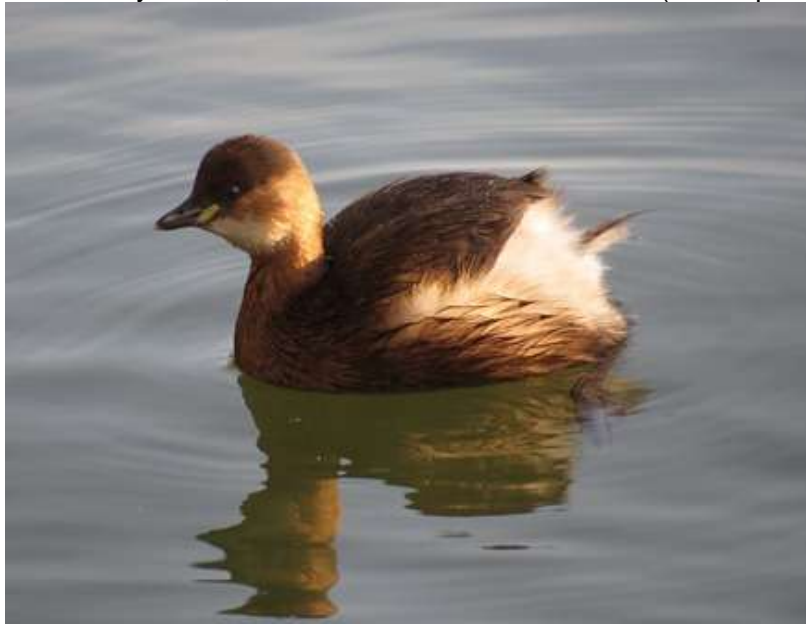
Little Grebe at Blackwall Basin

21 January 2015, Blackwall Basin: 2 Little Grebes (Tom Speller).