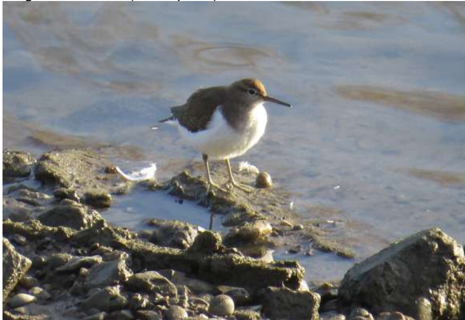
Common Sandpiper at Bow Creek photo: Tom Speller)

9 December 2015, Bow Creek: 1 Common Sandpiper, 2 Redshanks, 2 Grey Wagtails, 107 Teal (Tom Speller).