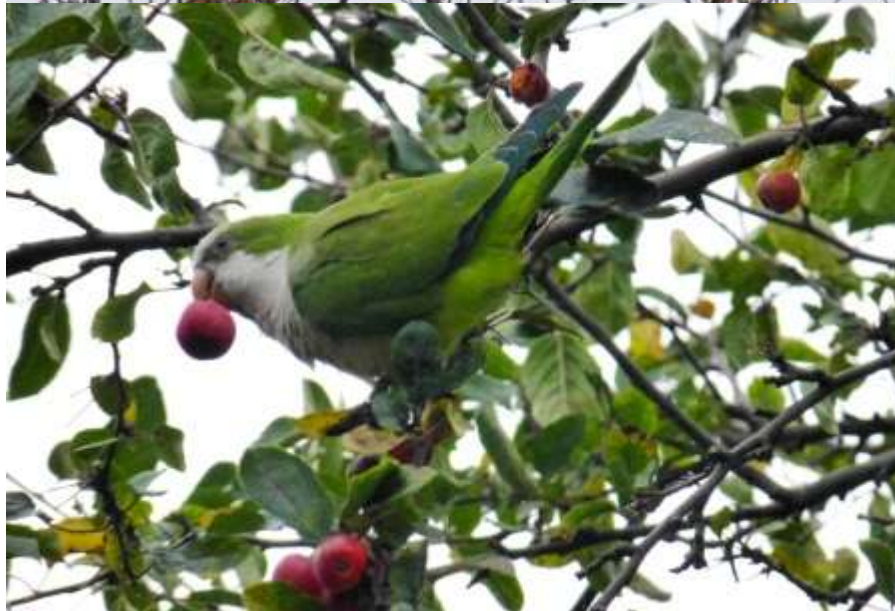
Monk Parakeets at Mudchute (photos: John Archer)

10 November 2015, Tower Hamlets Cemetery Park: the male Firecrest still in Sanctuary Wood (Bob Watts).