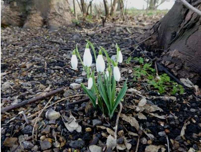
Snowdrops at East India Dock Basin