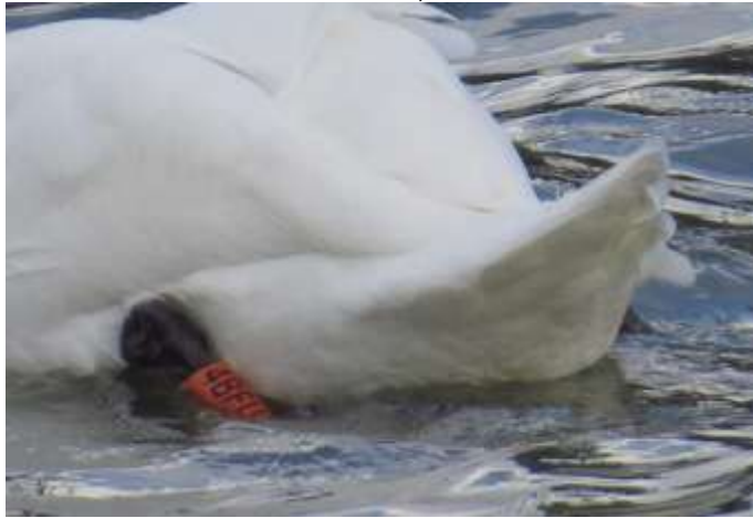
Mute Swan "4BFU" at Millwall Docks