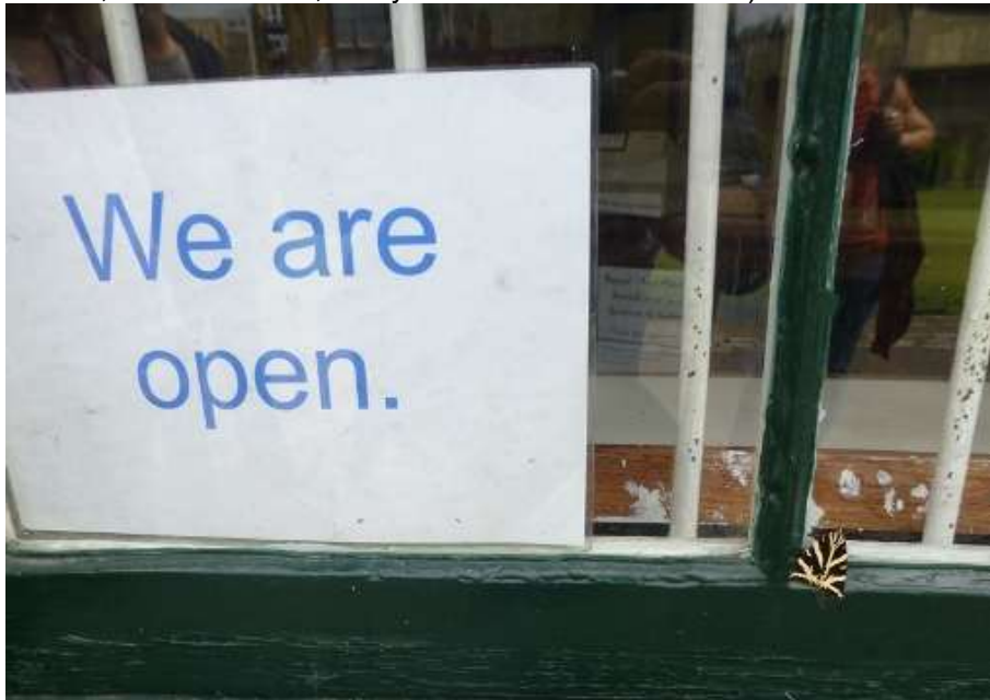
Jersey Tiger on the Ragged School Museum cafe window