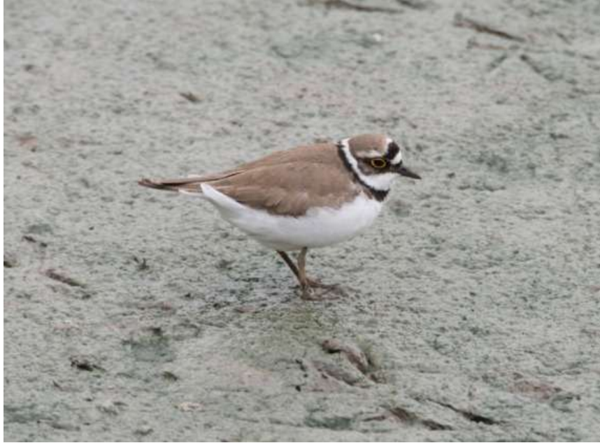
Little Ringed Plover at East India Dock Basin

2 May 2015, East India Dock Basin: 1 Little Ringed Plover (David Darrell-Lambert).