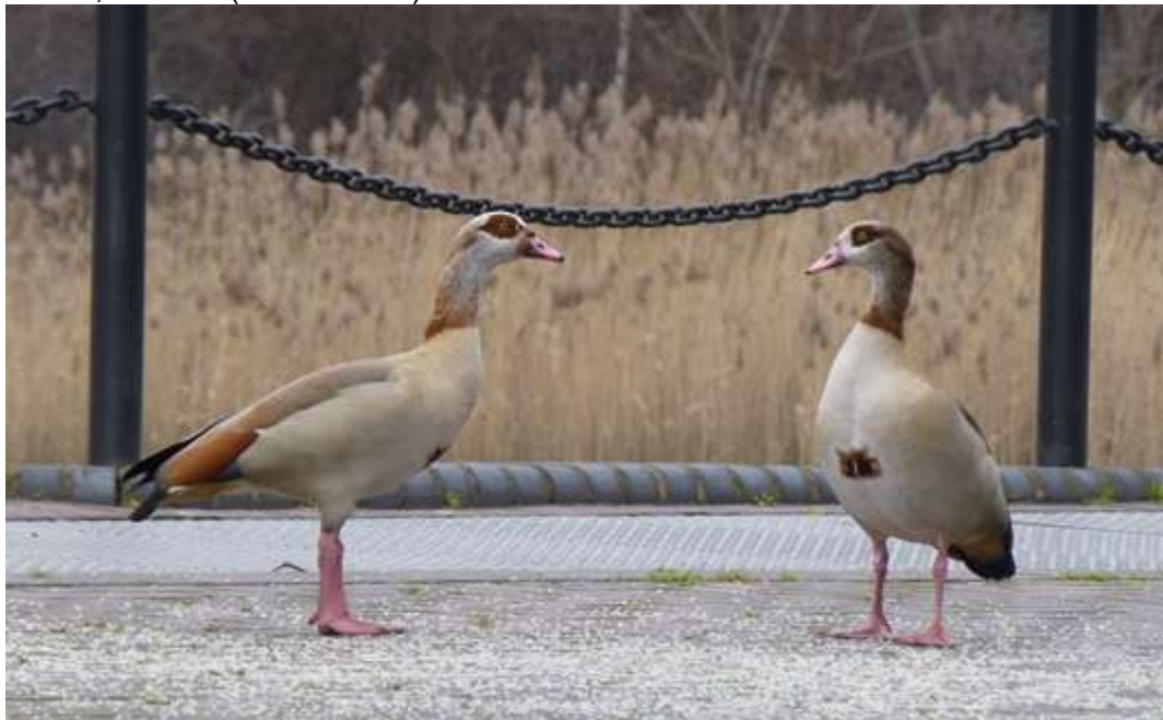
Egyptian Geese at East India Dock Basin

10 February 2015, East India Dock Basin: 2 Egyptian Geese, 2 Shelducks, 26 Tufted Ducks, 45 Teal (John Archer).