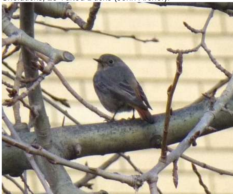
Black Redstart by East India Dock Basin