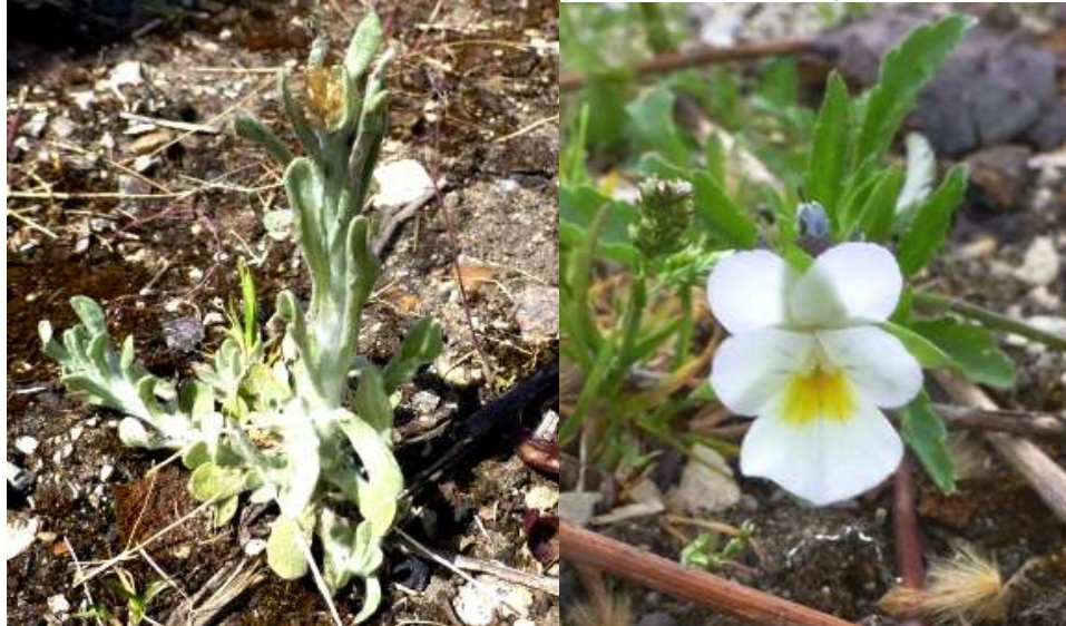
Jersey Cudweed (left) and Field Pansy at Silvocea Way