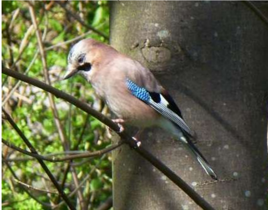
Jay at East India Dock Basin