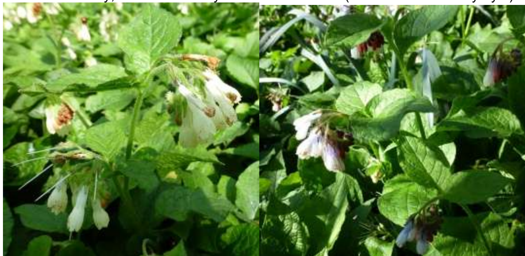
Tuberous (left) and Hidcote Comfrees

23 April 2015, Tower Hamlets Cemetery Park: 2 signing Song Thrushes, several Blackcaps singing, loads of butterflies including Orange Tips, Brimstones, Peacocks, Small Tortoiseshells, Large and Small Whites and a Comma, 1 queen Brown-banded Carder Bee, several Hairy-footed Flower Bees, lots of wild flowers blooming including Ramsons, Bluebells, Lesser Celandine, Summer Snowflake, Tuberous Comfrey, Hidcote Comfrey, Wild Strawberry and Sweet Violets (John Archer & Terry Lyle).