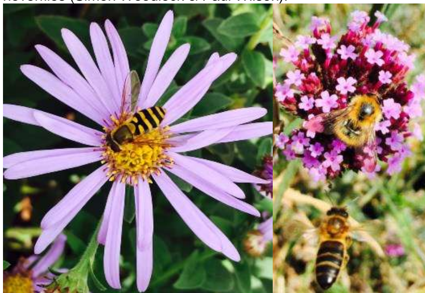
Hoverfly ( Syrphus sp.) (left), Common Carder Bee (top right) and Honey Bee (photos: Simon Woodlock)

17 September 2015, Elf Green: lots of pollinating insects in the nectar-rich garden beside the meadow, including Common Carder Bees, Honey Bees and Syrphus hoverflies (Simon Woodlock & Paul Wilson).