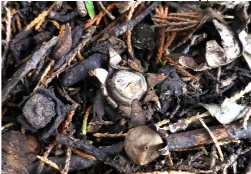
Daisy Earthstars at KEMP