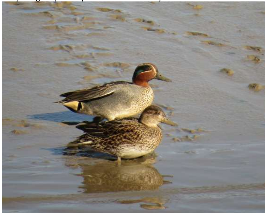
Pair of Teal at East India Dock Basin

9 December 2015, East India Dock Basin: a Fieldfare in the north-west scrub, 1 Little Grebe, 9 Tufted Ducks, 2 Shelducks, 80+ Teal, 1 Goldcrest, 8+ Long-tailed Tits, 1 Grey Wagtail (Tom Speller & John Archer).