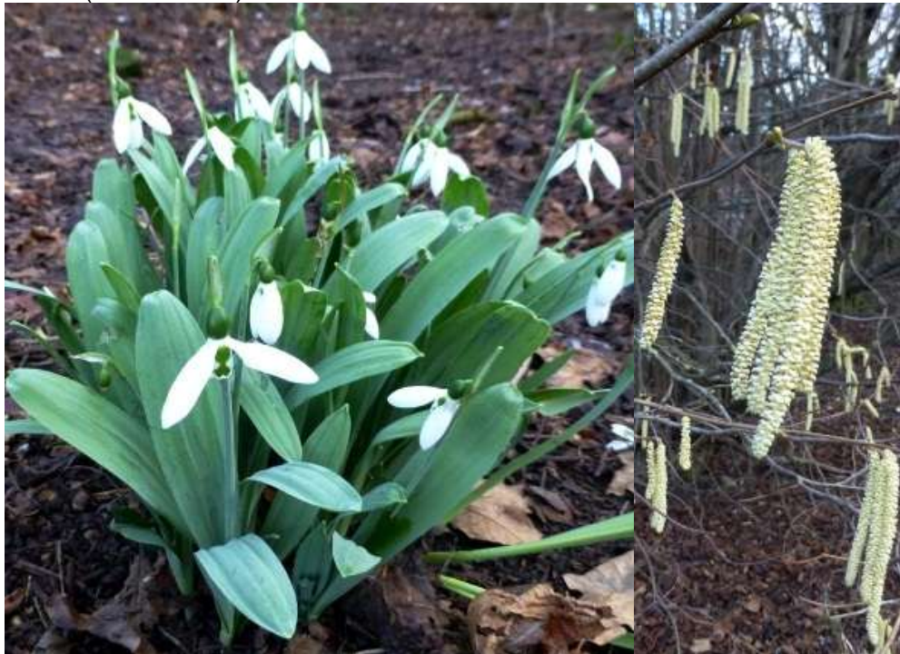
Greater Snowdrop (left) and Hazel in flower at Weavers Woodland Walk

14 January 2015, Weavers Woodland Walk: a male Sparrowhawk hunting along the hedge at the edge of the woodland narrowly failed to catch a Robin, also 3 Chaffinches, 2 Long-tailed Tits and both Hazel and Greater Snowdrops in flower (John Archer).