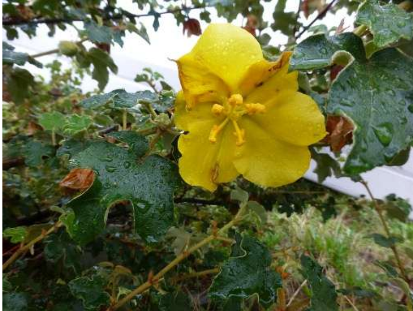
Flannel Bush on Tent Street Viaduct

24 August 2015, Disused Viaduct by Tent Street E1: a single large specimen of Flannel Bush ( Fremontedendron ), a fairly popular garden shrub rarely if ever recorded in the wild in Britain, growing in waste ground where it does not appear to be a relic of former cultivation (John Archer).