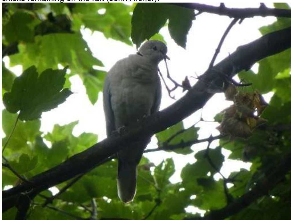
Collared Dove at East India Dock Basin (photo: John Archer)

29 July 2015, East India Dock Basin: 1 Collared Dove feeding on the path beside the Copse (rare here, especially perched, as most recent records have been fly-overs), 3 just-fledged Common Terns (we think 2 more fledged last week and have left) with 4 chicks remaining on the raft (John Archer).