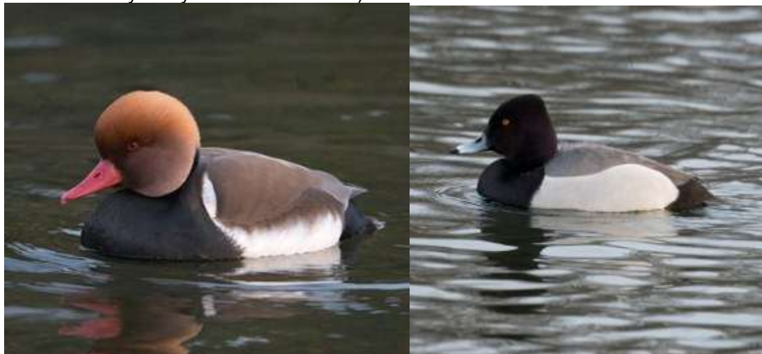
Red-crested Pochard (left) and Pochard x Tufted Duck hybrid

7 March 2015, Victoria Park: a pair of Sparrowhawks, about 100 Ring-necked Parakeets flying out of roost, 8 Red-crested Pochards, 6 Shovelers, 13 Gadwall, 20 Pochards, 59 Tufted Ducks, 1 Pochard x Tufted Duck hybrid, 1 Little Grebe giving its territorial trilling call, 2 Egyptian Geese, 10 Greylag Geese, 1 Meadow Pipit, 5 Fieldfares, 5 Redwings, 5 Mistle Thrushes including 2 pairs in territorial dispute, 15 Stock Doves, 2 Green Woodpeckers (David Darrell-Lambert and 12 participants on the Bird Barmy Army dawn chorus walk).