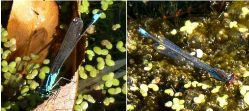
Blue-tailed (left) and Small Red-eyed Damselflies on the Wapping Canal