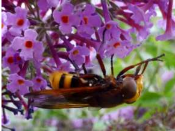
Volucella zonaria at East India Dock Basin

21 July 2015, East India Dock Basin: a 15-minute count for the Tower Hamlets Bee Survey recorded 3 Tree Bumblebees, 3 Early Bumblebees, 2 Buff-tailed Bumblebees (and another 18 either Buff-tailed or White-tailed), 2 unidentified bumblebees and 15 Honey Bees. Also 2 of the hornet-mimic hoverfly Volucella zonaria , 1 juvenile Shelduck, 1 Little Ringed Plover, 20 adult Common Terns with at least 9 chicks (4 of them close to fledging), 1 Tufted Duck, 1 singing Reed Warbler (John Archer).