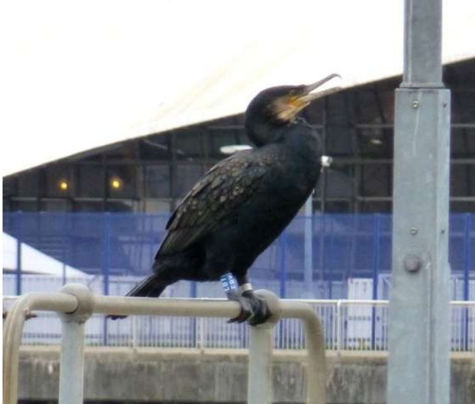
Colour-ringed Cormorant "Blue EBY" at East India Dock Basin (John Archer)

22 October 2015, East India Dock Basin: the Estonian-ringed Cormorant "Blue EBY" again on the jetty, 1 Little Grebe, 2 Grey Wagtails, 80+ Teal (John Archer).