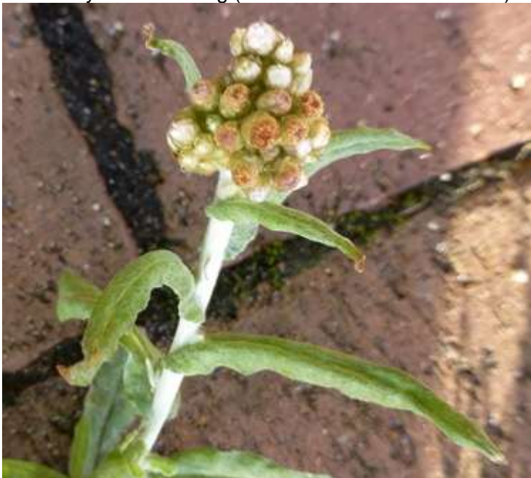
Jersey Cudweed at Millwall Slipway