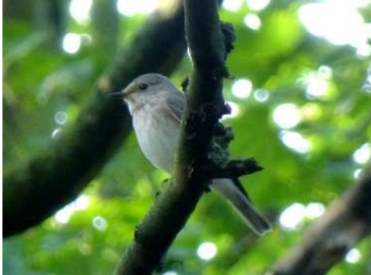
Spotted Flycatcher at East India Dock Basin

1 September 2015, East India Dock Basin: 1 Spotted Flycatcher, 1 Garden Warbler, 1+ Willow Warbler and 1 Chiffchaff in the Copse, 2 Whitethroats in the north-west scrub, 2 Teal, 2 Mute Swans (John Archer).