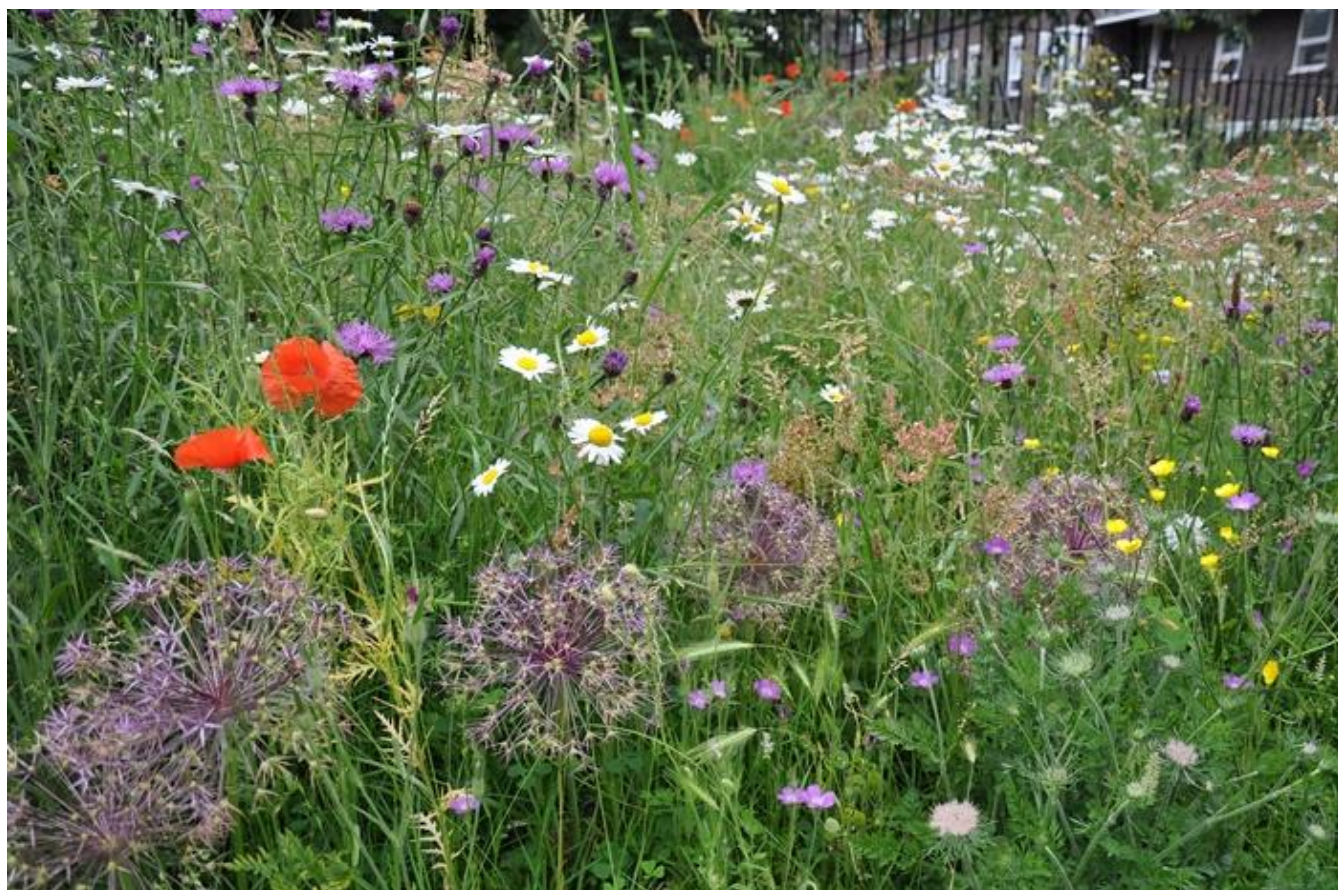
This beautiful meadow at Approach Gardens was created under the 2014-19 LBAP