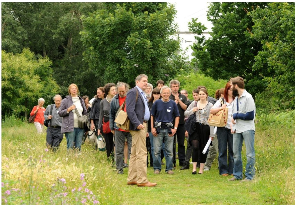
A guided walk in Mile End Park

There are plenty of parks where new meadows, orchards and hedges can be created, as well as increasing the amount of nectar-rich flowers and native trees. Suitable locations for new woodland, open mosaic habitats and ponds are more limited, but opportunities may be found to create these habitats. Parks also represent the best opportunity to increase the borough's population of Black Poplars.