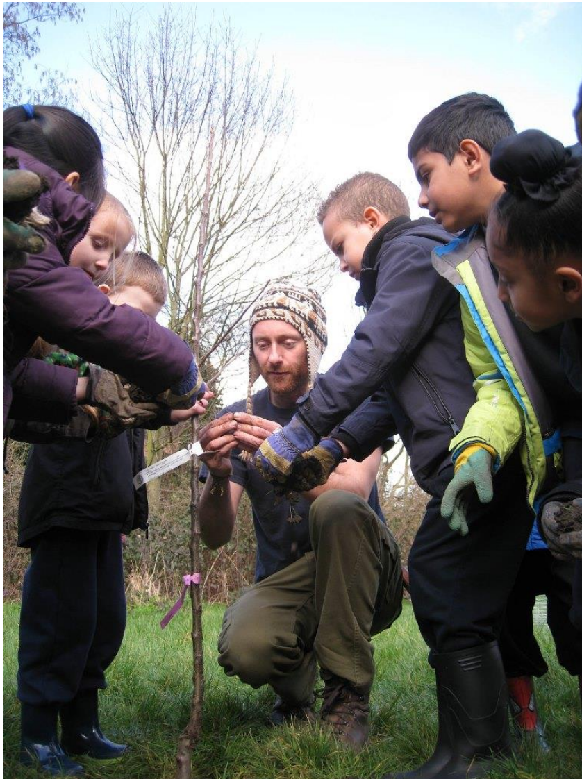
Children help to plant a fruit tree in a new orchard at Mudchute