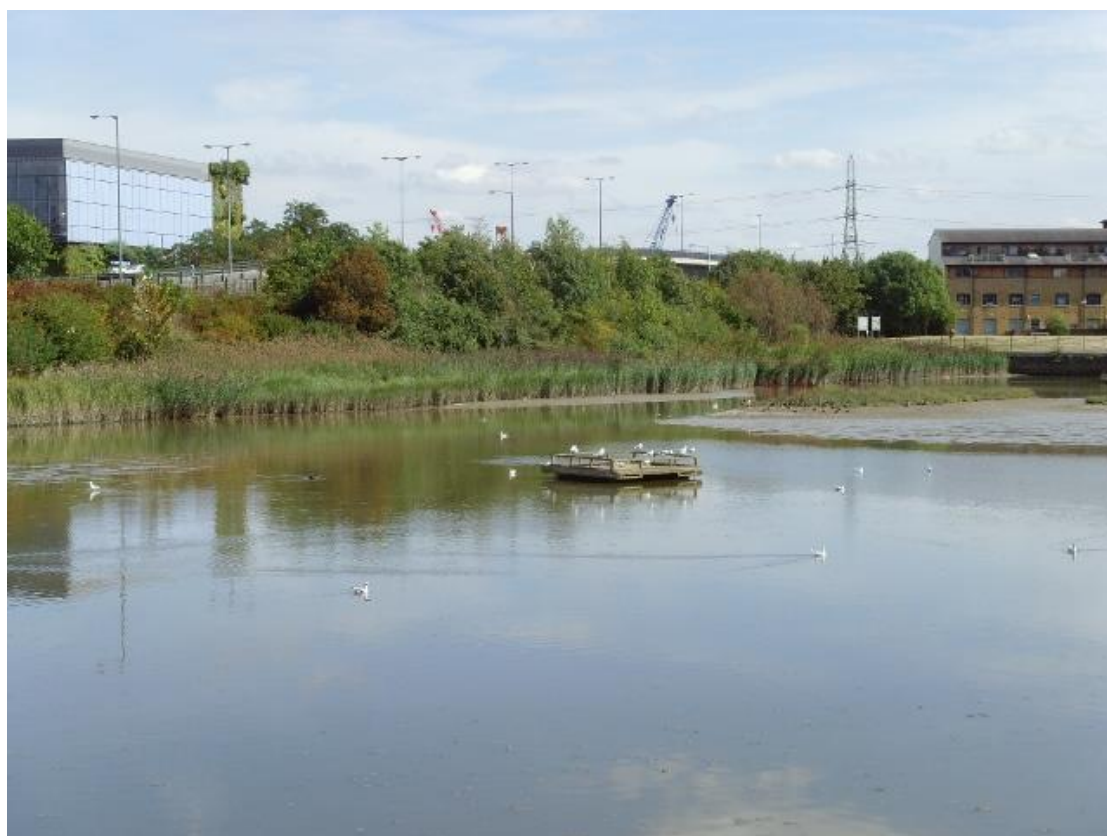
East India Dock Basin Nature Reserve is one of the best wetlands in the borough

Water quality can be enhanced through getting rid of sewer misconnections, and through sustainable urban drainage systems (SuDS) reducing surface water runoff into rivers. The priorities for biodiversity action are to diversify the habitats in the waterways and docks, control invasive species, and increase the number of ponds.