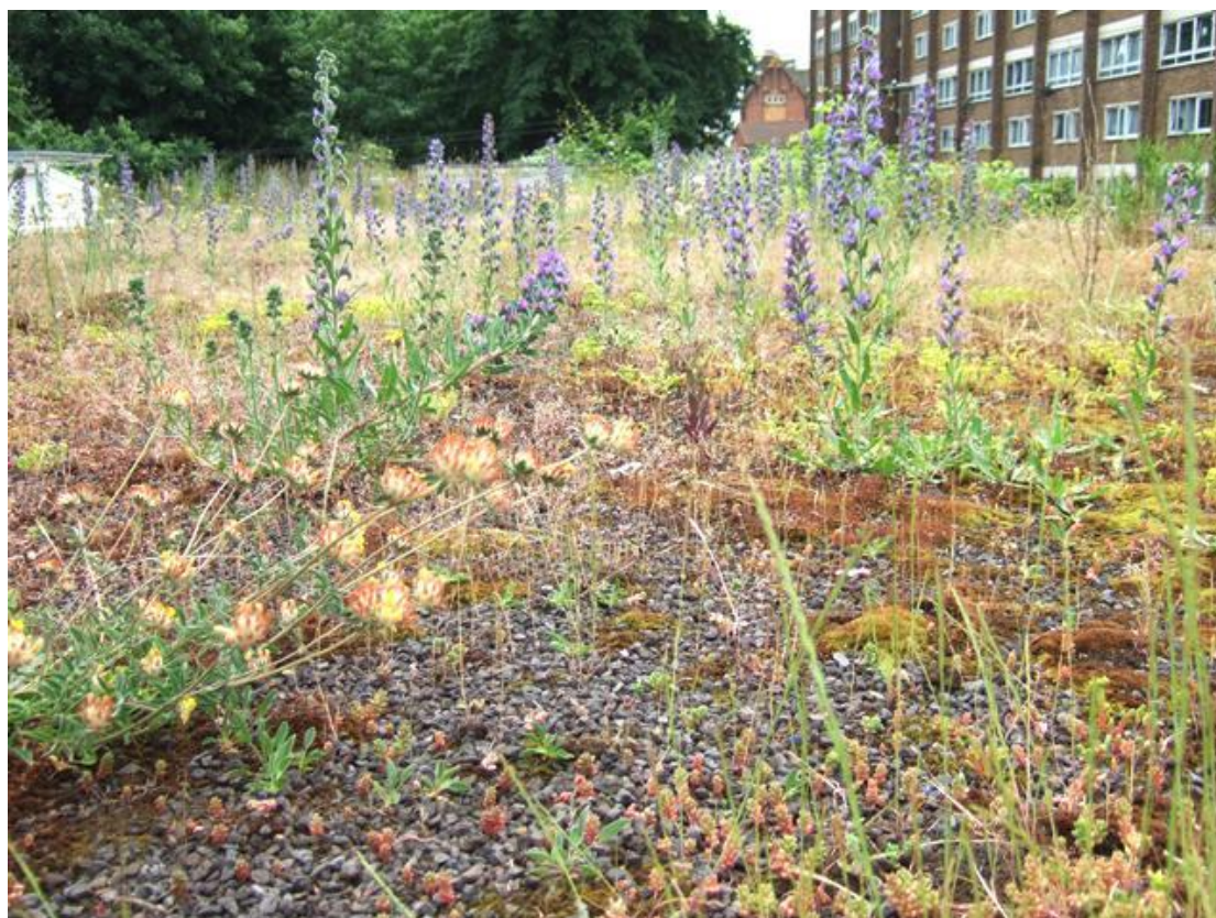
Biodiverse green roof on the Soanes Centre, Tower Hamlets Cemetery Park

We can enhance the built environment for wildlife in many ways. Green roofs are the easiest place to replace our disappearing brownfield (open mosaic) habitats. Buildings can be enhanced for bats and birds by providing custom-designed nesting and roosting sites, either built into the fabric of new buildings or retrofitted to existing ones. Climbers and other forms of green walls can provide nectar for bees and nesting sites for our declining House Sparrows. And streets can be greened with trees, hedges and planters full of nectar-rich flowers.