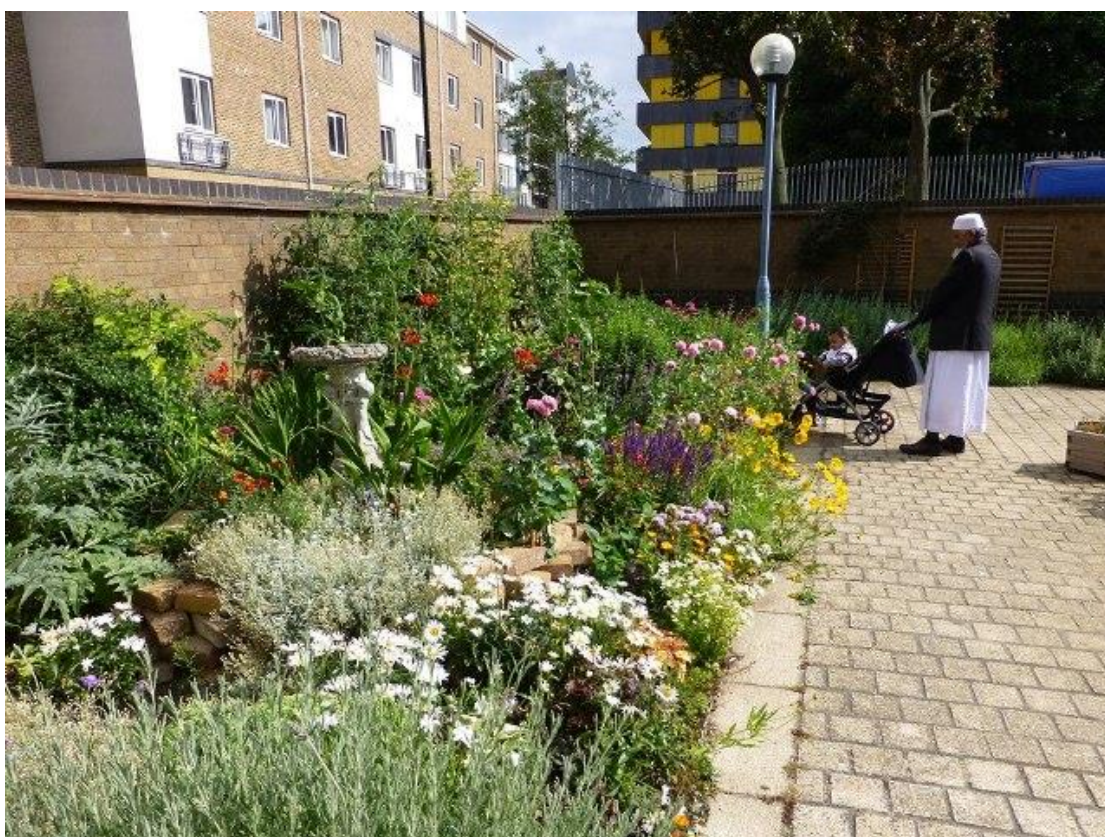
Winterton House Organic Garden has lots of nectar-rich flowers for bees

Landscaping around industrial premises may not need to look too “tidy” all the time, and often doesn’t have a recreational function. This offers an opportunity to retain or create at ground level the open mosaic habitats which are disappearing as brownfield sites are developed, and are increasingly being restricted to green roofs.