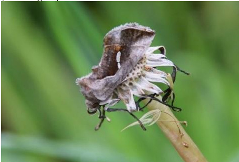
Dewick's Plusia at Scrapyard Meadow (Gino Brignoli)

25 May 2021, Tower Hamlets Cemetery Park: a Dewick's Plusia moth in Scrapyard Meadow (Gino Brignoli)