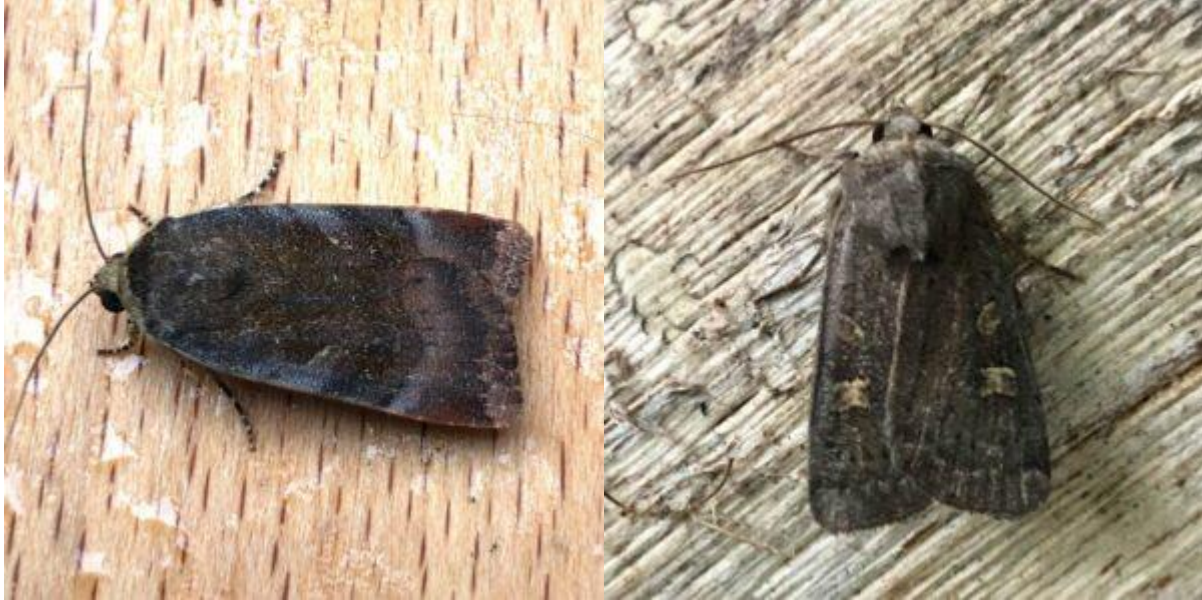
Lesser Broad-bordered Yellow Underwing (left) and Square-spot Rustic at Bethnal Green Nature Reserve. Click to enlarge

21 August 2021, Bethnal Green Nature Reserve: a community moth-trapping session by the London Moth Project recorded eight species of moths: The Rustic, Square-spot Rustic, Common Rustic, Large Yellow Underwing, Lesser Broad-bordered Yellow Underwing, Mother-of-Pearl, Mint Moth and Light Brown Apple Moth. See this post for more information and photos from this event.