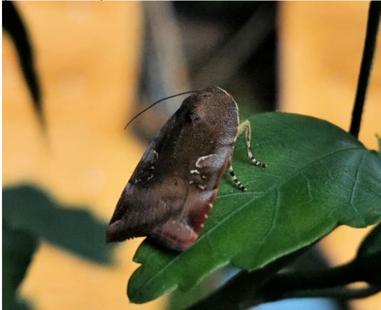
Lesser Broad-bordered Yellow Underwing (Peter Minvalla)

21 July 2021, Hesperus Crescent E14: a Lesser Broad-bordered Yellow Underwing moth (Peter Minvalla).