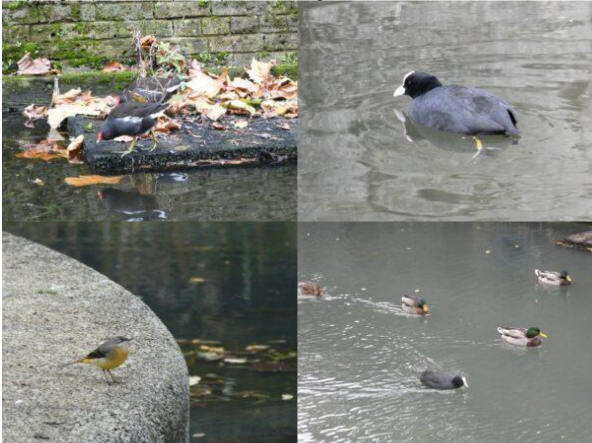
Clockwise from top left: Moorhens, Coot, Mallards and Coot, Grey Wagtail (John Archer)

28 October 2021, Wapping Canal: 2 Mute Swans, 54 Mallards, 14 Coots, 20 Moorhens, 1 Grey Wagtail (John Archer). Click photos to enlarge