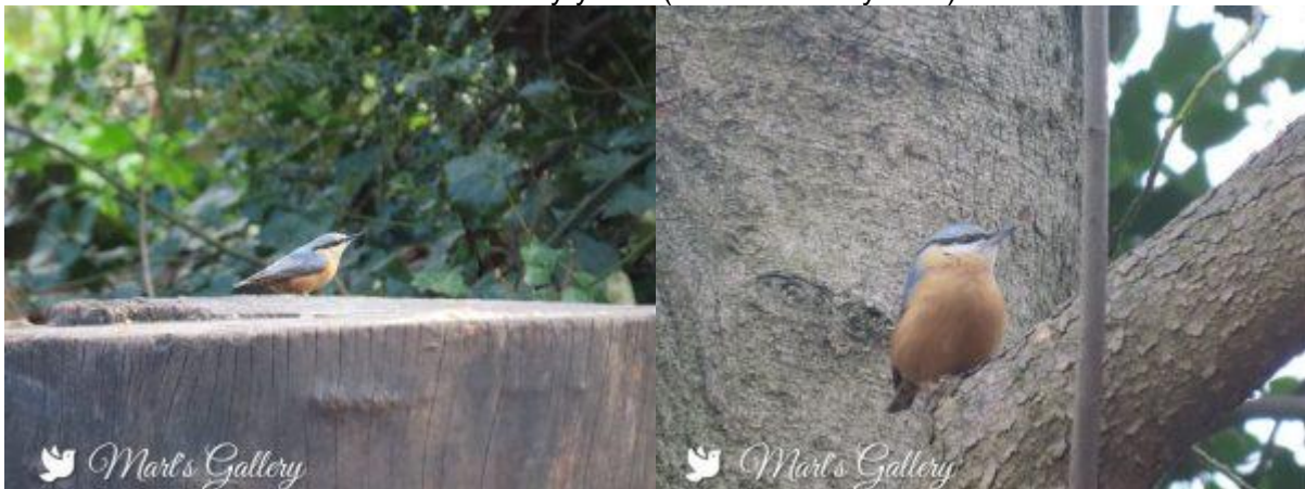
Nuthatch at Cemetery Park Click photos to enlarge