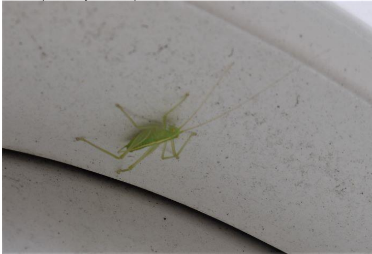
Oak Bush-cricket at Maritime Quay (Harvey Smith)

26 July 2021, Maritime Quay E14: an Oak Bush-cricket hiding inside the wing mirror cover of a car (Harvey Smith).