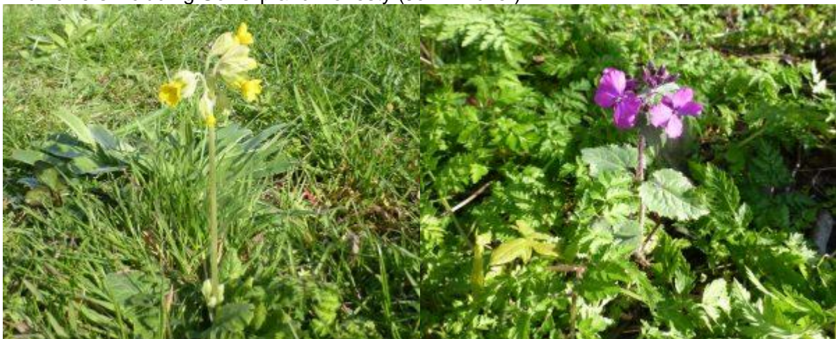
Cowslip (left) and Honesty at East India Dock Basin (John Archer) Click photos to enlarge

11 April 2021, East India Dock Basin: a count for the Wetland Bird Survey recorded 2 Little Ringed Plovers, 4 Shelducks, 8 Teal, 3 Tufted Ducks, 15 Mallards, 2 Mute Swans, 2 Coots, 3 Moorhens, 1 Great Black-backed Gull, 1 Black-headed Gull, 2 Lesser Black-backed Gulls, 1 Herring Gull and 1 Cormorant. Also 1 Kestrel, 1 singing Blackcap, 1 Chiffchaff and lot of wild flowers including Cowslip and Honesty (John Archer).