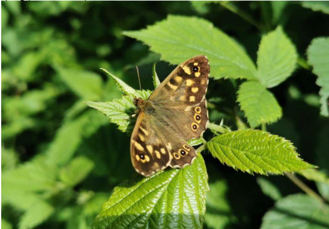
Speckled Wood at Mudchute (Peter Minvalla)

27 May 2021, Mudchute: 1 Speckled Wood, but all the butterflies seem to be very late this spring (Peter Minvalla).