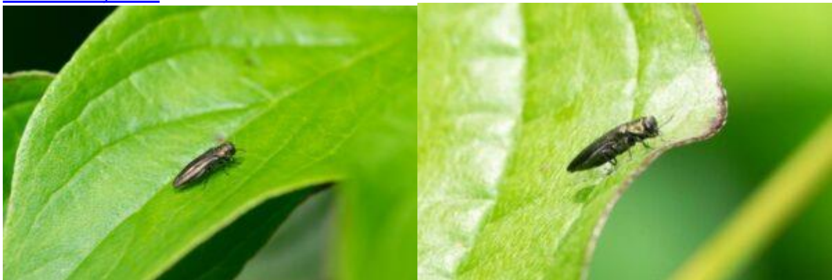
Jewel beetles at Cemetery Park (Gino Brignoli) click to enlarge

1 July 2021, Tower Hamlets Cemetery Park: lots of jewel beetles (probably Agrilus cuprescens ) on the shrubs at either end of Scrapyard Meadow and in Horse Chestnut Glade (Gino Brignoli). This is the first site record, and the 479th species of beetle to be recorded in Cemetery Park .