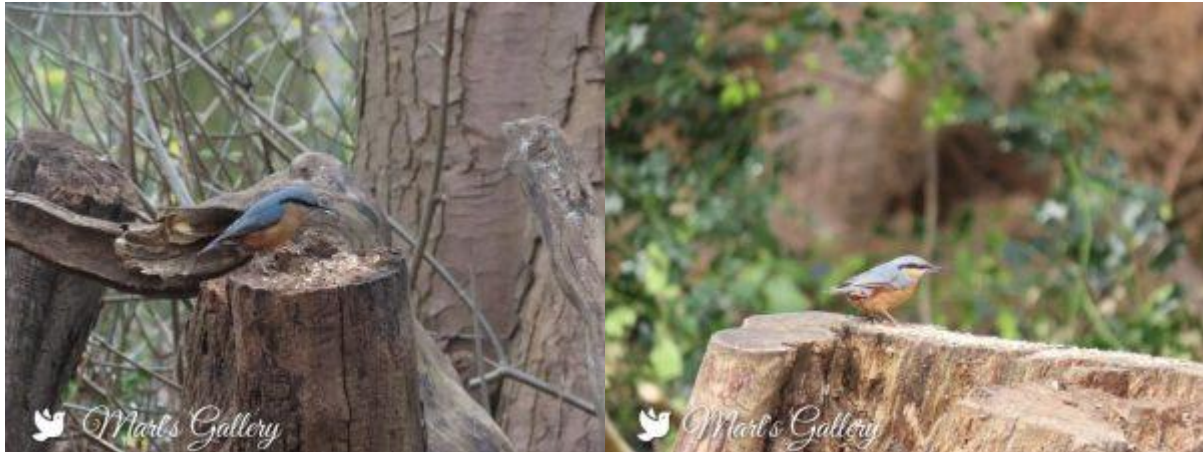
Nuthatch at Cemetery Park Click photos to enlarge

23 March 2021, Thomas Road E14: a Kestrel hovering.