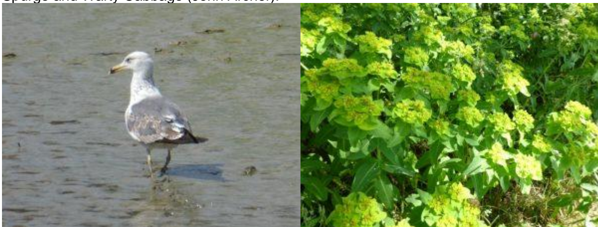
Lesser Black-backed Gull (left) and Twiggy Spurge (John Archer) click to enlarge

12 June 2021, East India Dock Basin: a count for the Wetland Bird Survey recorded 6 Shelducks, 9 Tufted Ducks, 1 Egyptian Goose, 2 Mute Swans, 5 Grey Herons, 28 Mallards, 2 Coots, 5 Moorhens and a Lesser Black-backed Gull. Also 3 Swifts, 3 singing Reed Warblers, a singing Blackcap and lots of wild flowers in bloom, including lots of Twiggy Spurge and Warty Cabbage (John Archer).