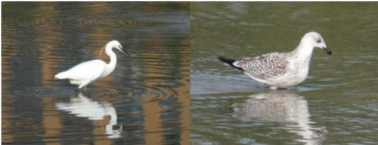
Little Egret (left) and Great Black-backed Gull at East India Dock Basin (John Archer) click to enlarge

9 October 2021, East India Dock Basin: a count for the Wetland Bird Survey recorded 2 Little Egrets, 2 Egyptian Geese, 1 Canada Goose, 2 Mute Swans, 80 Teal, 40 Mallards, 1 Grey Heron, 1 Cormorant, 8 Moorhens, 3 Great Black-backed Gulls, 1 Lesser Black-backed Gull, 1 Herring Gull and 73 Black-headed Gulls. Also 1 Grey Wagtail, 1 Red Admiral and 3+ Migrant Hawker dragonflies (John Archer).