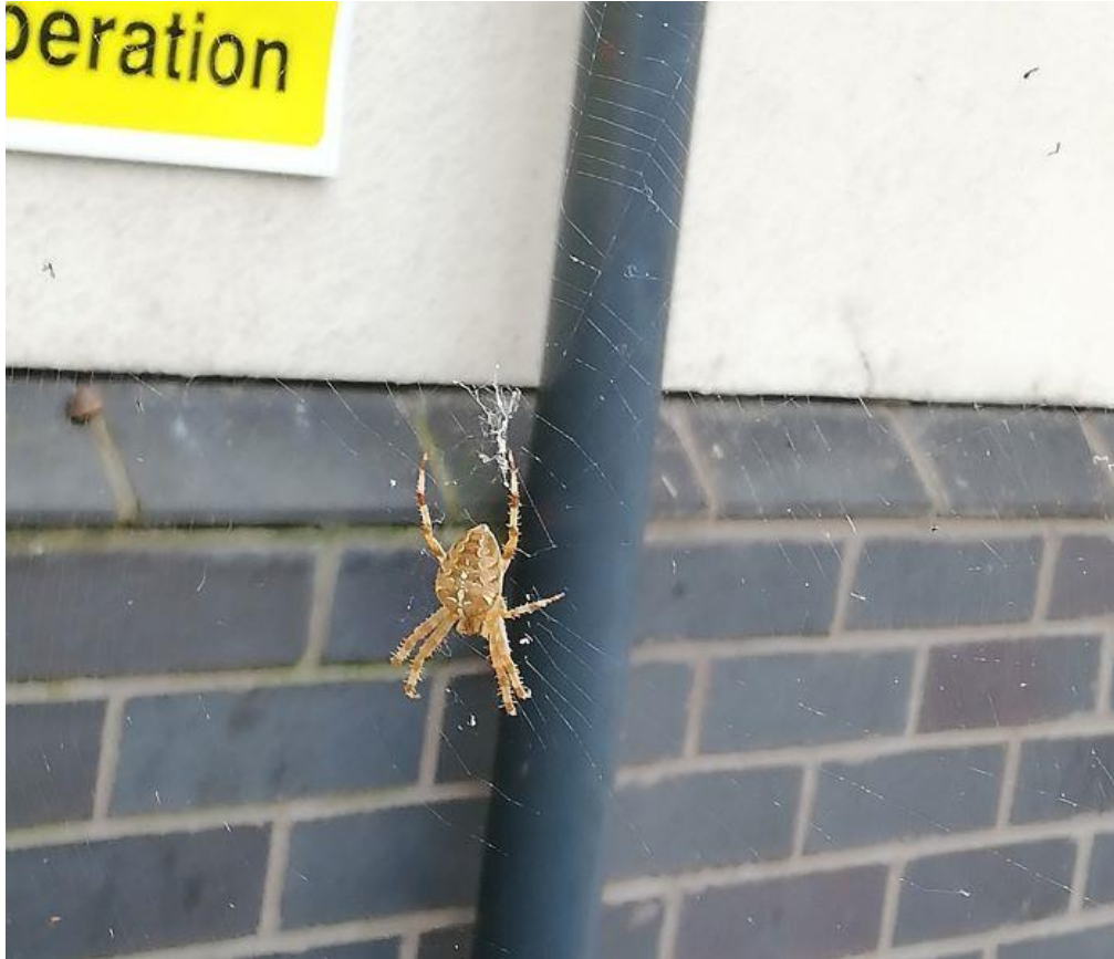
Garden Spider outside Arnhem Wharf School

26 September 2021, Arnhem Wharf School: a Garden Spider ( Araneus diadematus) outside the school.