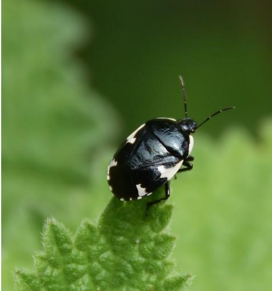
Rambur's Pied Shieldbug at Cemetery Park