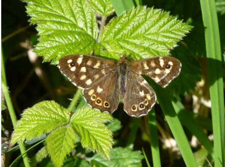
Speckled Wood at Mudchute