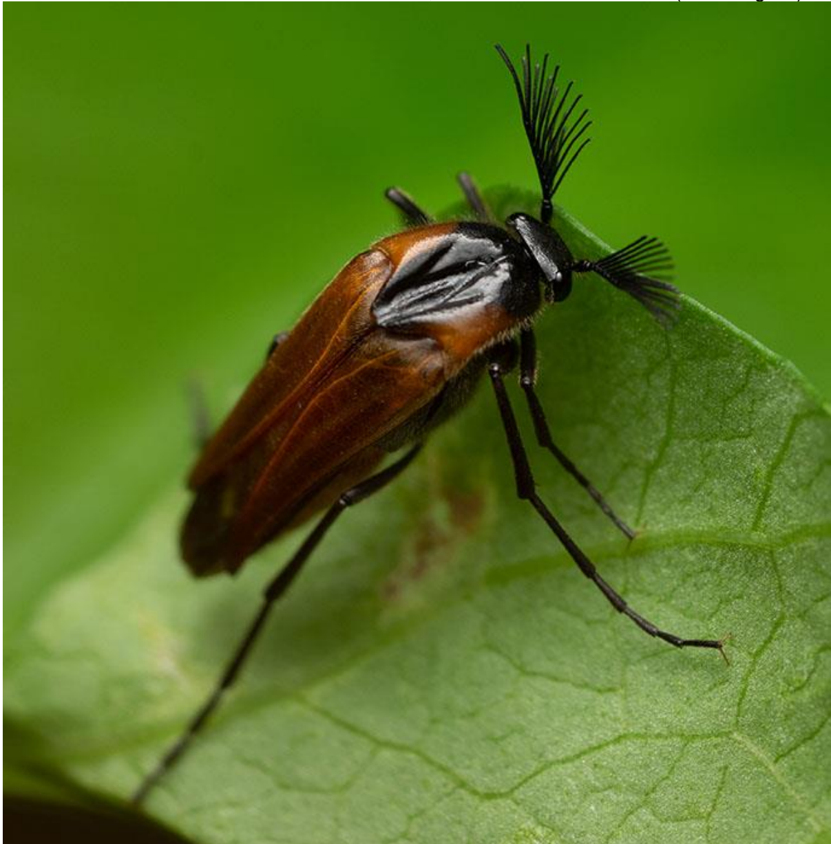
Wasp Nest Beetle at Cemetery Park (Gino Brignoli)

10 August 2021, Tower Hamlets Cemetery Park: a Wasp Nest Beetle ( Metoecus paradoxus ) beside the Westwood and Barbados monument, the first record for the site (Gino Brignoli).