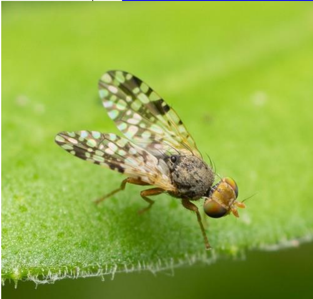
Tephritis praecox at Bethnal Green Nature Reserve (Gino Brignoli)

24 July 2021, Bethnal Green Nature Reserve: an individual of the nationally-rare picture-winged fly Tephritis praecox in the medicine garden (Gino Brignoli). This is the first Tower Hamlets record of the species. See this post for more details of this exciting record.