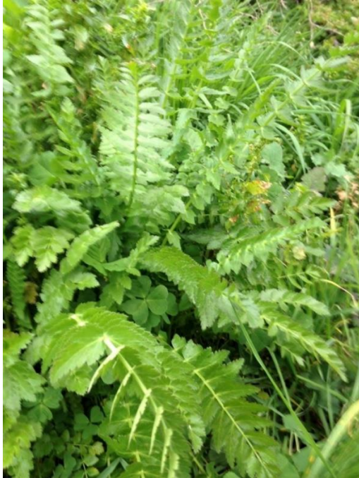
Corn Parsley in Mile End Park (John Swindells)

6 April 2021, Mile End Park: several plants of Corn Parsley in the meadow north of Clinton Road, where it hadn't been seen since 2013. This is one of only two places in the old county of Middlesex where Corn Parsley grows wild, the other being an old lawn at the Natural History Museum (John Swindells).