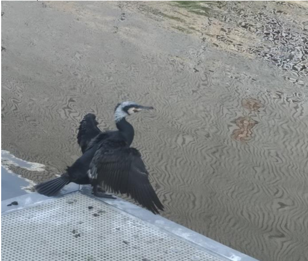
Cormorant by the Limehouse Cut