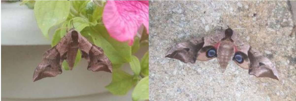
Eyed Hawk-moth at Lady Mico's Almshouses click to enlarge

29 June 2021, Lady Mico's Almshouses: an Eyed Hawk-moth in the garden. Click photos to enlarge