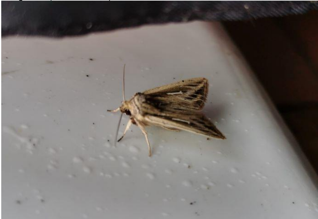
L-album Wainscot at Hesperus Crescent (Peter Minvalla)

11 June 2021, Hesperus Crescent E14: a L-album Wainscot moth, a rare migrant to London, in a garden (Peter Minvalla).