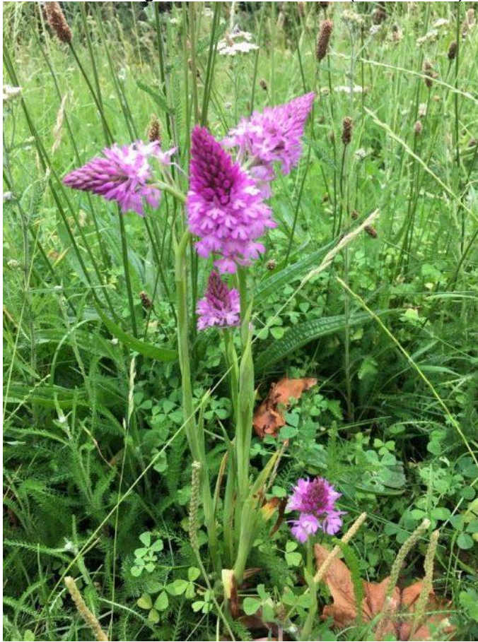
Pyramidal Orchids by the A13 (Bob Gilbert)

19 June 2021, Leamouth: 5 spikes of Pyramidal Orchid on the grass verge of the A13 just west of the bridge over the River Lea (Bob Gilbert).