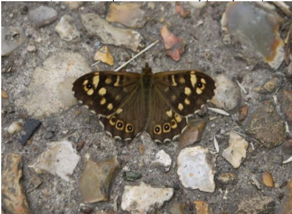
Speckled Wood at Mudchute (Harvey Smith)

6 June 2021, Mudchute: 1 Speckled Wood butterfly (Harvey Smith).