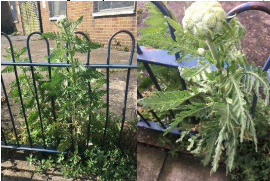
Rayed Tansy on Chrisp Street click to enlarge

18 May 2021, Chrisp Street E14: a large plant of Rayed Tansy, a scarce garden escape, at the base of railings at the junction with Cordelia Street.