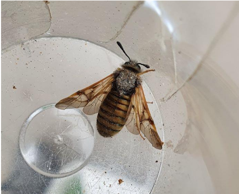
Club-horned sawfly ( Abia aenea ) at Cemetery Park (Ken Greenway)

6 April 2021, Victoria Park: 23 Tufted Ducks, 1 Pochard, 1 Great Crested Grebe, 4 Egyptian Geese with 5 juveniles, 1 Grey Heron, 1 Bar-headed Goose (or hybrid) on West Lake; 3 Tufted Ducks, 1 Gadwall, 1 Little Grebe, 2 Egyptian Geese, 1 Blackcap, 2 Mute Swans on East Lake; 2 Gadwall on the Boating Lake; also 1 Jay, 2 Mistle Thrushes (Richard Drew).