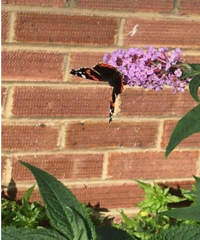
Red Admiral on Buddleia