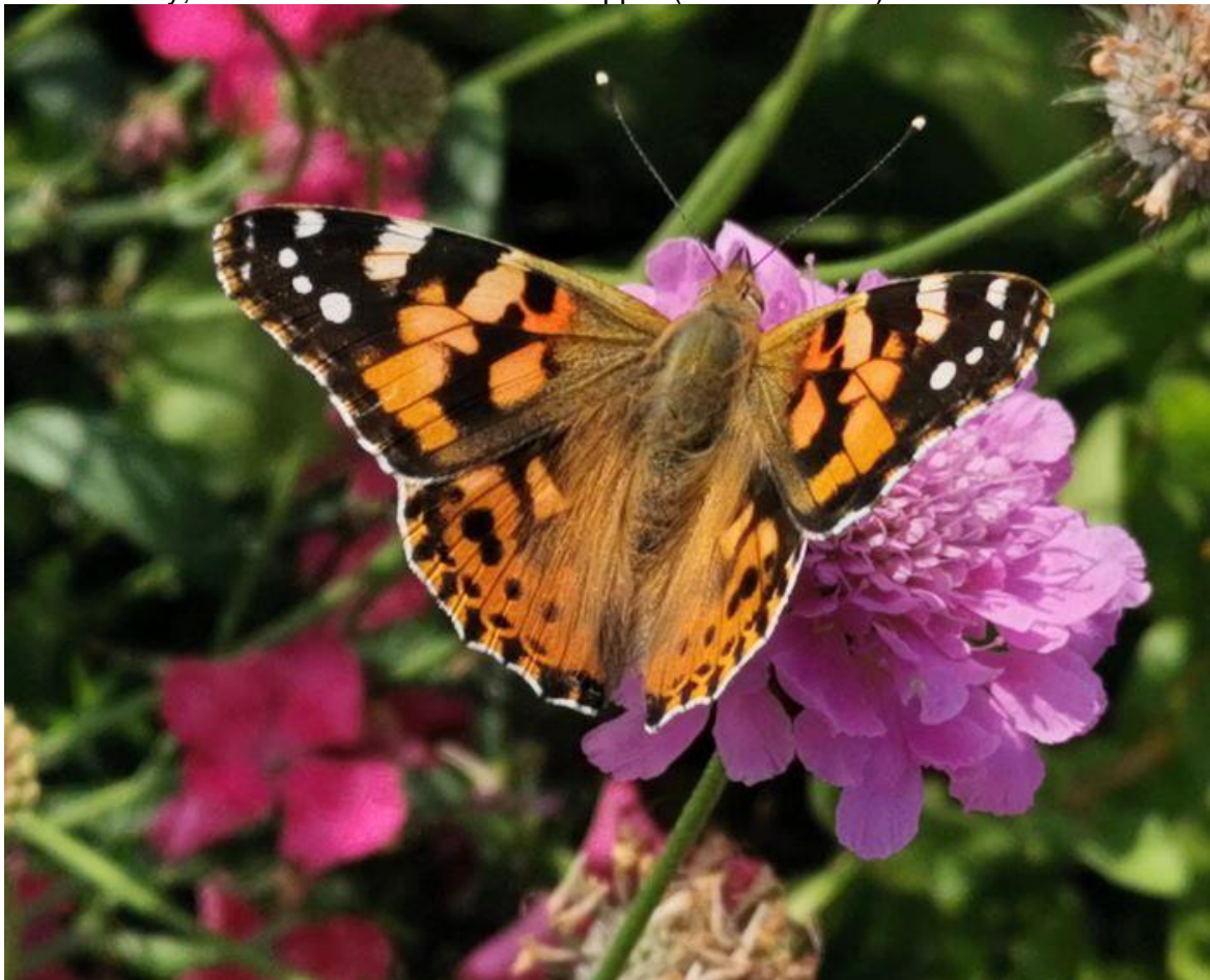
Painted Lady at Mudchute Allotments (Peter Minvalla)

23 July 2021, Mudchute Allotments: good numbers of butterflies in the sunshine, including Painted Lady, Meadow Brown and Small Skipper (Peter Minvalla).