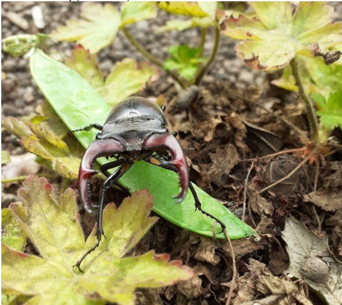
Stag Beetle at Resolution Plaza

25 June 2021, Aldgate: a male Stag Beetle outside EastendHomes' head office at 3 Resolution Plaza. This is the first record in Tower Hamlets for many years. It was found while staff were sorting and distributing food, and was perhaps accidentally transported there on a food delivery.