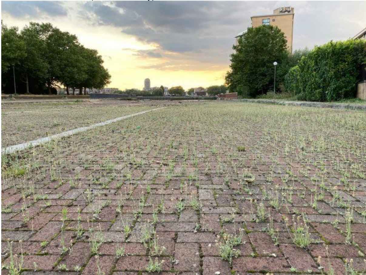
Jersey Cudweed at Millwall Slipway (Maureen Parry)

4 August 2021, Millwall Slipway: a big increase in Jersey Cudweed, with plants carpeting much of the brickwork (Maureen Parry).