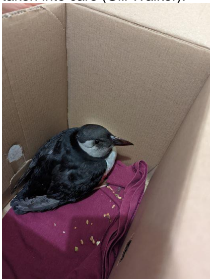
juvenile Puffin rescued from Victoria Park

21 November 2021, Victoria Park: an exhausted juvenile Puffin was rescued from Crows and taken into care.