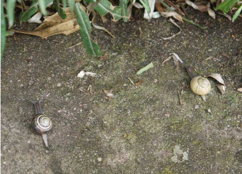
White-lipped Snails at Maritime Quay