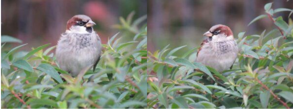
House Sparrow at Poplar Dock (Tom Speller) click to enlarge

30 November 2021, Poplar Dock: 3 Little Grebes, c20 House Sparrows (Tom Speller).