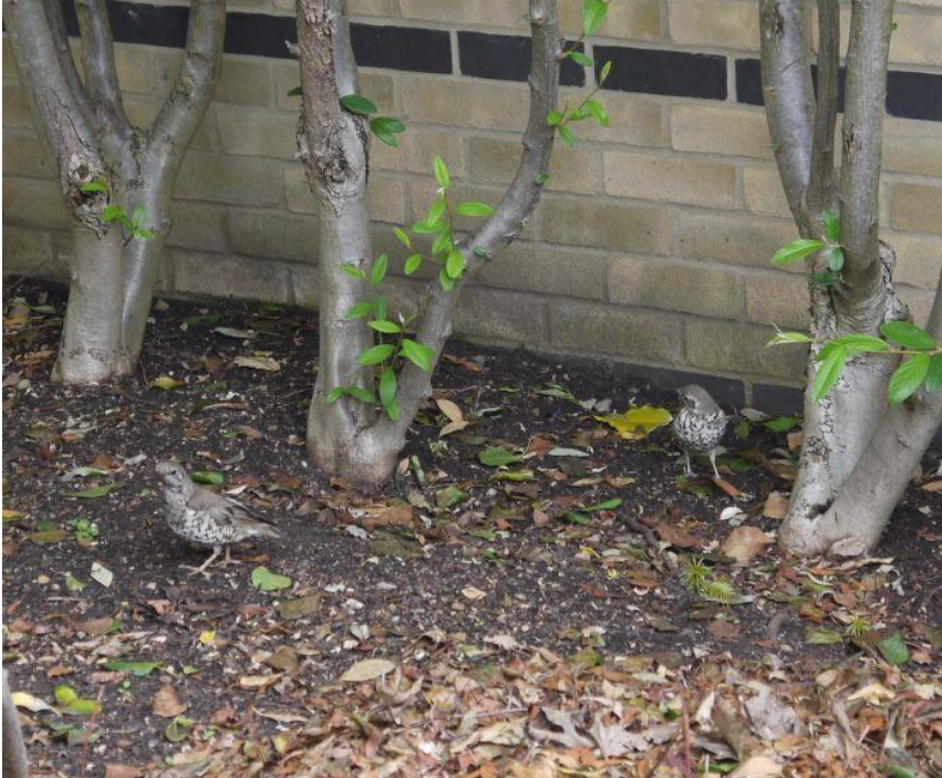
Mistle Thrushes by Ferry Street (Harvey Smith)

4 July 2021, Isle of Dogs: 2 recently-fledged Mistle Thrushes on Ferry Street near the Kinkao restaurant (Harvey Smith).