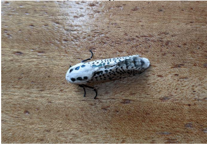
Leopard Moth at Montrose House

3 July 2021, Kingsbridge Estate, Isle of Dogs: a Leopard Moth on the front door of a flat in Montrose House.