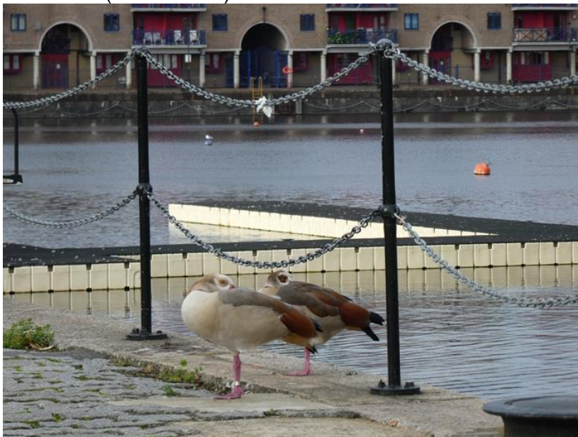
Egyptian Geese at Shadwell Basin (John Archer)

28 October 2021, Shadwell Basin: 2 Mute Swans, 2 Egyptian Geese, 4 Moorhens, 15 Coots, 6 Mallards (John Archer).