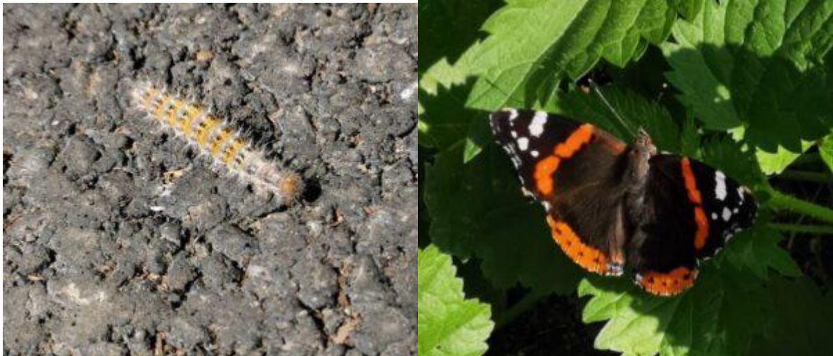
Painted Lady caterpillar (left) and Red Admiral at Mudchute

23 July 2021, Mudchute: a Painted Lady caterpillar and Red Admiral and Gatekeeper butterflies. Click photos to enlarge