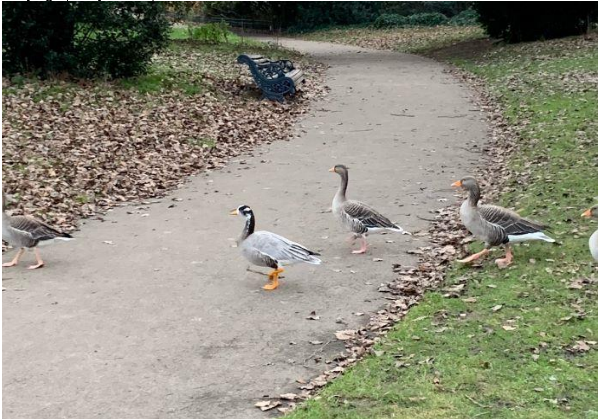
Hybrid Bar-headed x Greylag Goose with Greylags in Victoria Park

19 December 2021, Victoria Park: the hybrid Bar-headed x Greylag Goose still present with Greylags.