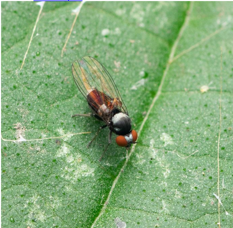
Agathomyia collini at Cemetery Park (Gino Brignoli)

18 July 2021, Tower Hamlets Cemetery Park: an individual of the nationally rare flat-footed fly Agathomyia collini in Sanctuary Wood. There are very few recent British records of this species, which is classified as Endangered (Gino Brignoli). Read more about this exciting record in this news post .