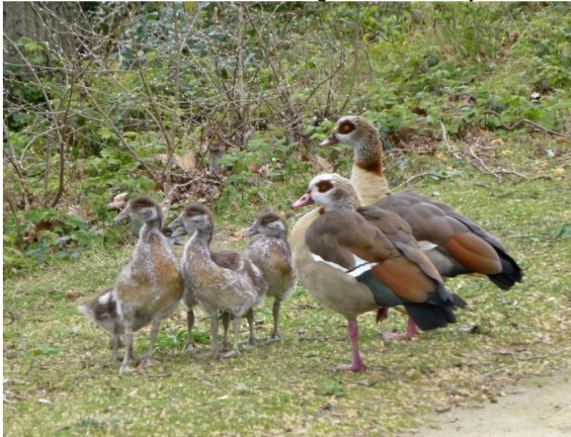
Egyptian Goose family at Victoria Park (John Archer)

6 April 2021, Victoria Park: 23 Tufted Ducks, 1 Pochard, 1 Great Crested Grebe, 4 Egyptian Geese with 5 juveniles, 1 Grey Heron, 1 Bar-headed Goose (or hybrid) on West Lake; 3 Tufted Ducks, 1 Gadwall, 1 Little Grebe, 2 Egyptian Geese, 1 Blackcap, 2 Mute Swans on East Lake; 2 Gadwall on the Boating Lake; also 1 Jay, 2 Mistle Thrushes (Richard Drew).