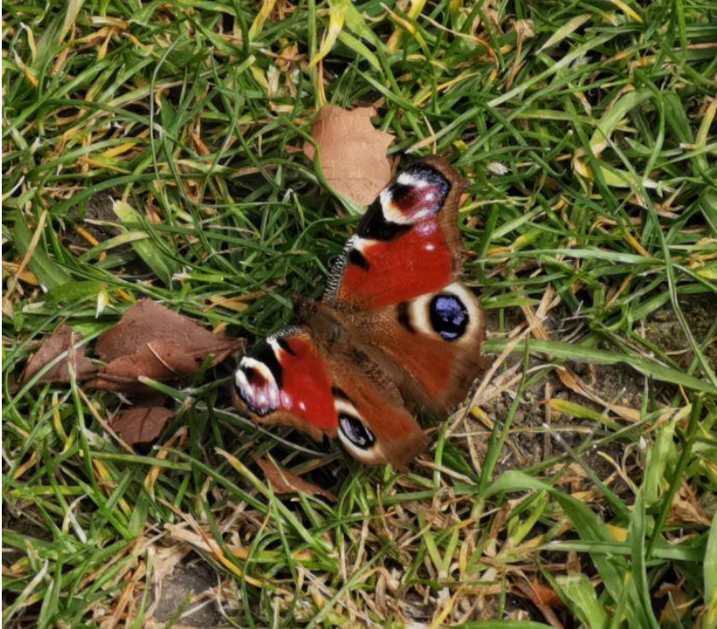
Peacock butterfly at Millwall Park (Peter Minvalla)

27 April 2021, Millwall Park: 1 Peacock butterfly (Peter Minvalla).