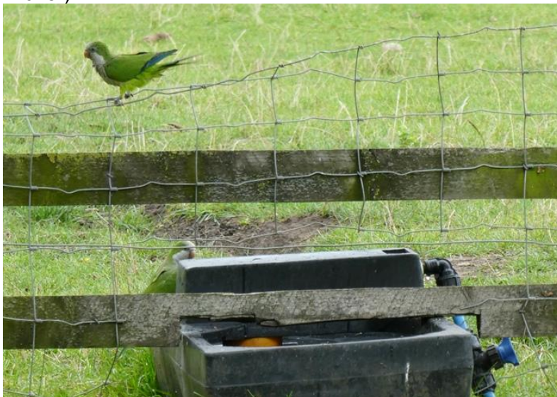
Monk Parakeets at Mudchute