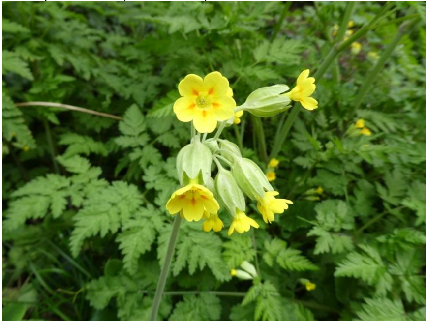
Cowslip at East India Dock Basin (John Archer)

19 April 2022, East India Dock Basin: a count for the Wetland Bird Survey recorded 21 Tufted Ducks, 4 Shelducks, 2 Mute Swans, 2 Canada Geese, 33 Mallards, 2 Coots, 5 Moorhens, 2 Lesser Black-backed Gulls and 3 Herring Gulls. Also a Blackcap singing and Cowslips in flower (John Archer).