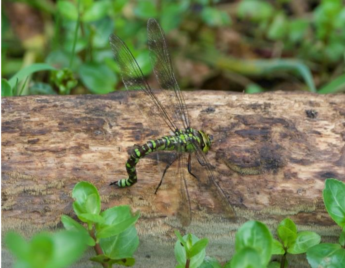
Southern Hawker at Mudchute (Richard Saville)

5 September 2022, Mudchute: 17 House Martins, 4 Ring-necked Parakeets, 3 Robins, 4 Long-tailed Tits, 1 Southern Hawker dragonfly, 4 Common Darters, 1 Common Blue butterfly, 6 Speckled Woods (Richard Saville).