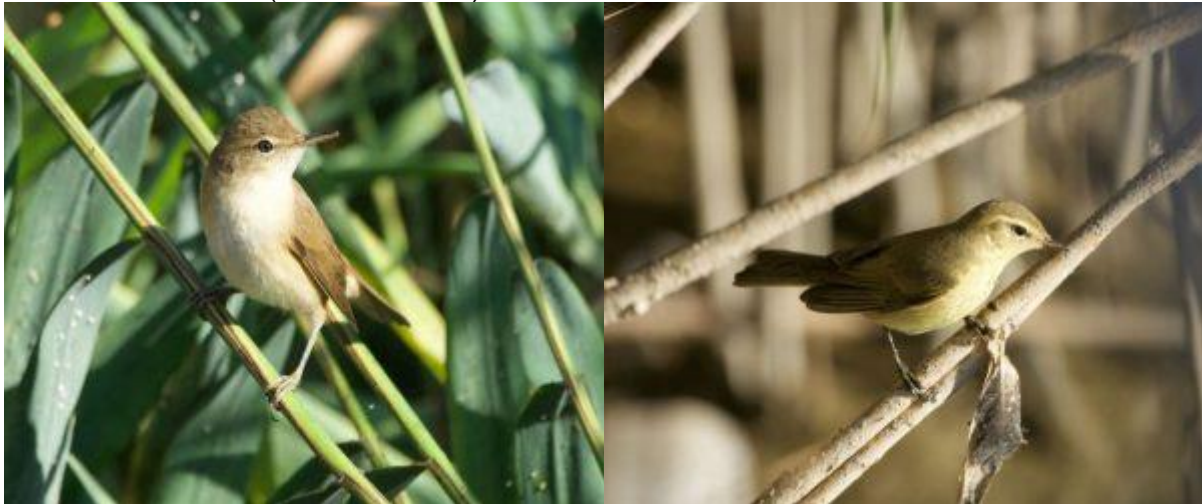
Reed Warbler (left) and Chiffchaff at East India Dock Basin (Richard Saville) click to enlarge

8 August 2022, East India Dock Basin: 3 Grey Wagtails, 4 Reed Warblers, 1 Chiffchaff, 1 Cetti's Warbler, 1 Grey Heron, 5 Cormorants, a pair of Egyptian Geese with 3 goslings, 80 Black-headed Gulls (Richard Saville).