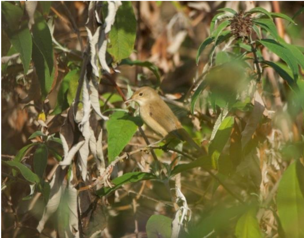
Reed Warbler at Poplar Dock Marina