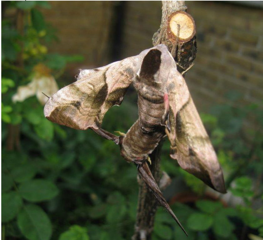
Eyed Hawkmoths mating at Da Gama Close (Harvey Smith)

2 June 2022, Da Gama Close E14: a mating pair of Eyed Hawkmoths in a garden (Harvey Smith).