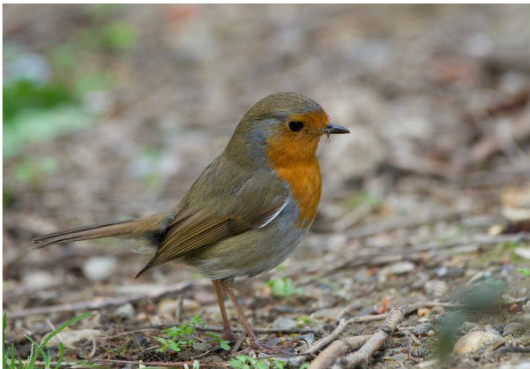
Robin at Mudchute