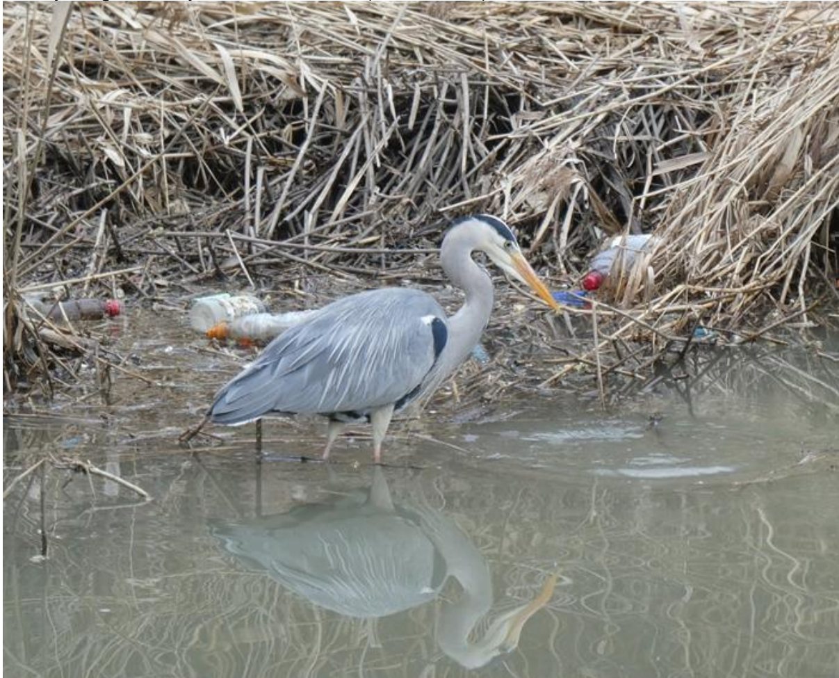
Grey Heron at East India Dock Basin (John Archer)

22 January 2022, East India Dock Basin: a count for the Wetland Bird Survey recorded 16 Shelducks, 1 Tufted Duck, 18 Teal, 15 Mallards, 2 Mute Swans, 2 Grey Herons, 8 Moorhens, 1 Cormorant, 4 Common Gulls, 2 Herring Gulls and 43 Black-headed Gulls. Also 1 Grey Wagtail, 1 Jay, 4+ Greenfinches (John Archer).