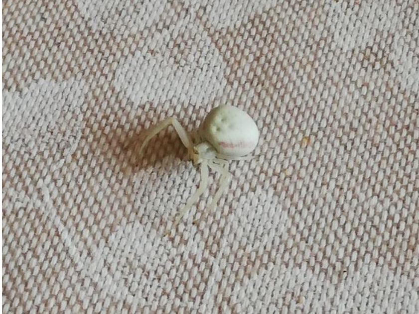
Flower Crab Spider at Da Gama Close (Harvey Smith)

5 June 2022, Da Gama Close E14: 1 Flower Crab Spider ( Misumena vatia ) (Harvey Smith).