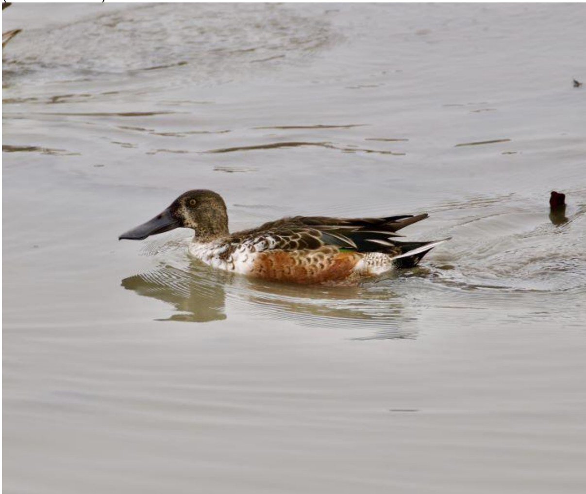
immature male Shoveler at East India Dock Basin (Richard Saville)

13 December 2022, East India Dock Basin: 3 Shovelers, the first record here since 2019 (Richard Saville).