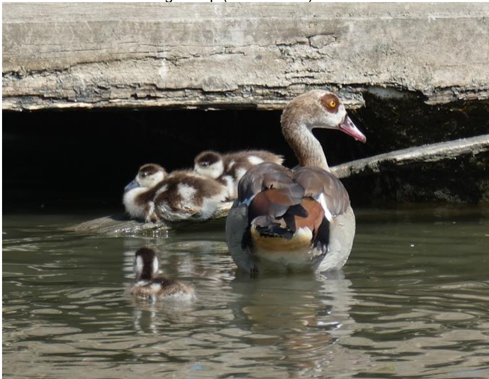
Egyptian Goose family at East India Dock Basin (John Archer)

14 August 2022, East India Dock Basin: a count for the Wetland Bird Survey recorded 1 Teal, an Egyptian Goose with 3 small goslings, 2 Canada Geese, 2 Mute Swans, 30 Mallards, 5 Moorhens, 1 Grey Heron, 1 Lesser Black-backed Gull and 120 Black-headed Gulls. Also 1 Grey Wagtail, 2 family groups of Reed Warblers, 1 Red Admiral, 1 Large White, 2 Small Whites and 2 large Carp (John Archer).