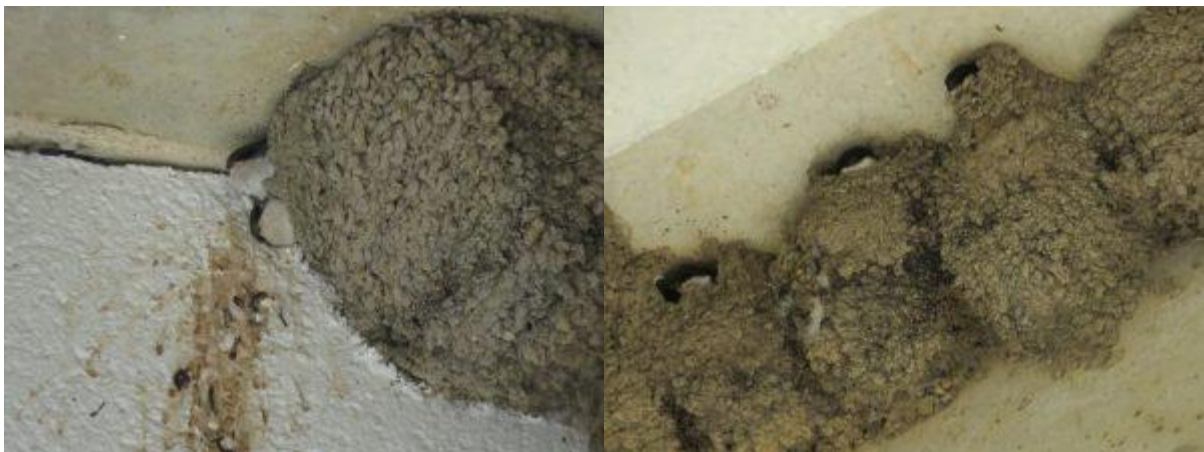
young House Martins in nests at Dundee Wharf click to enlarge

13 July 2022, Dundee Wharf E14: 16 active House Martin nests on buildings by the footbridge over Limekiln Dock.