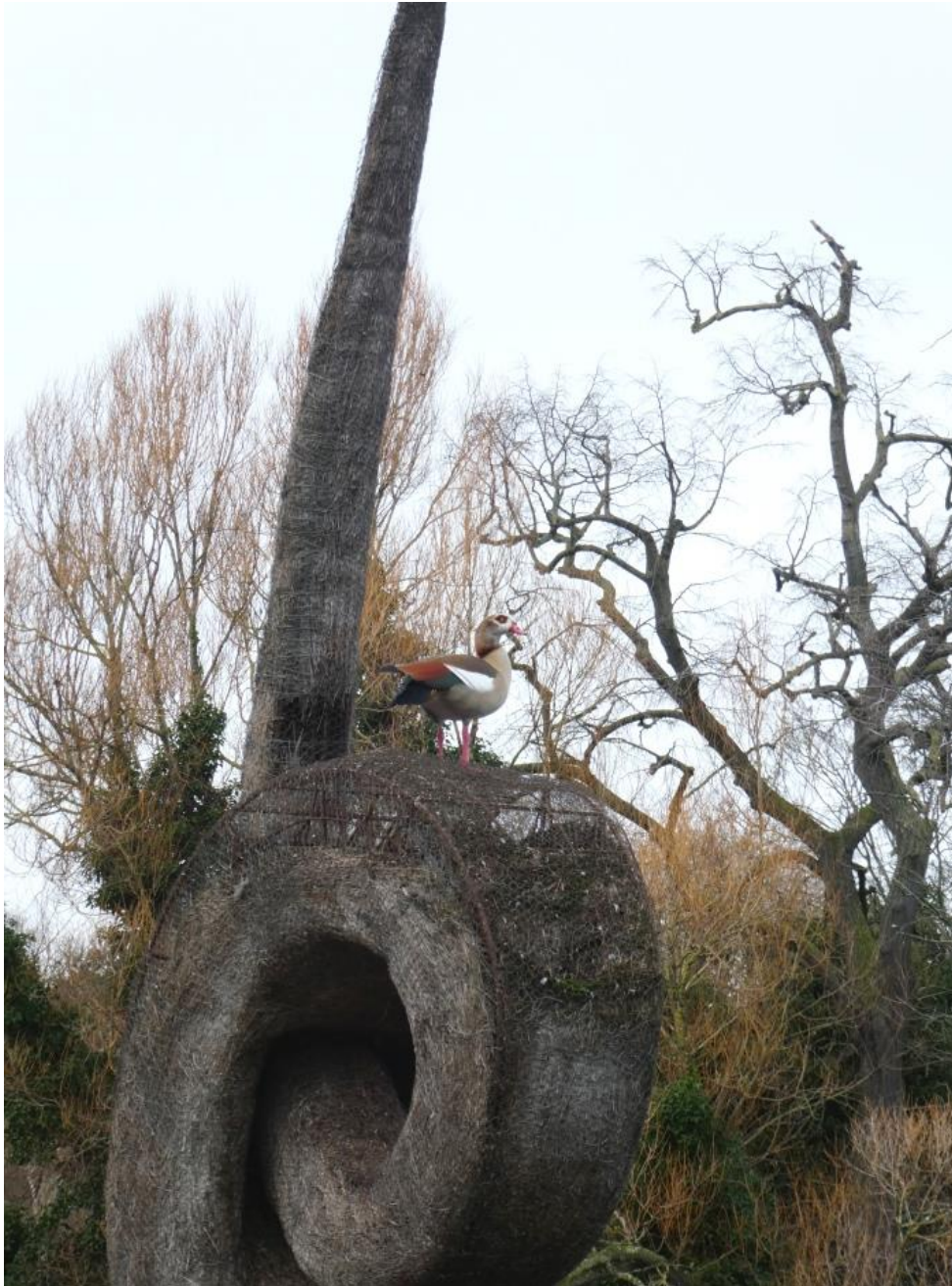
Egyptian Goose on one of the West Lake sculptures (John Archer)

9 February 2022, West India Docks: a group of 13 Mute Swans including 6 first-winter birds (Tom Speller).