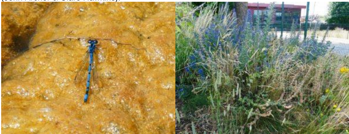
Azure Damselfly (left) & the wildflower meadow at Stepney City Farm click to enlarge