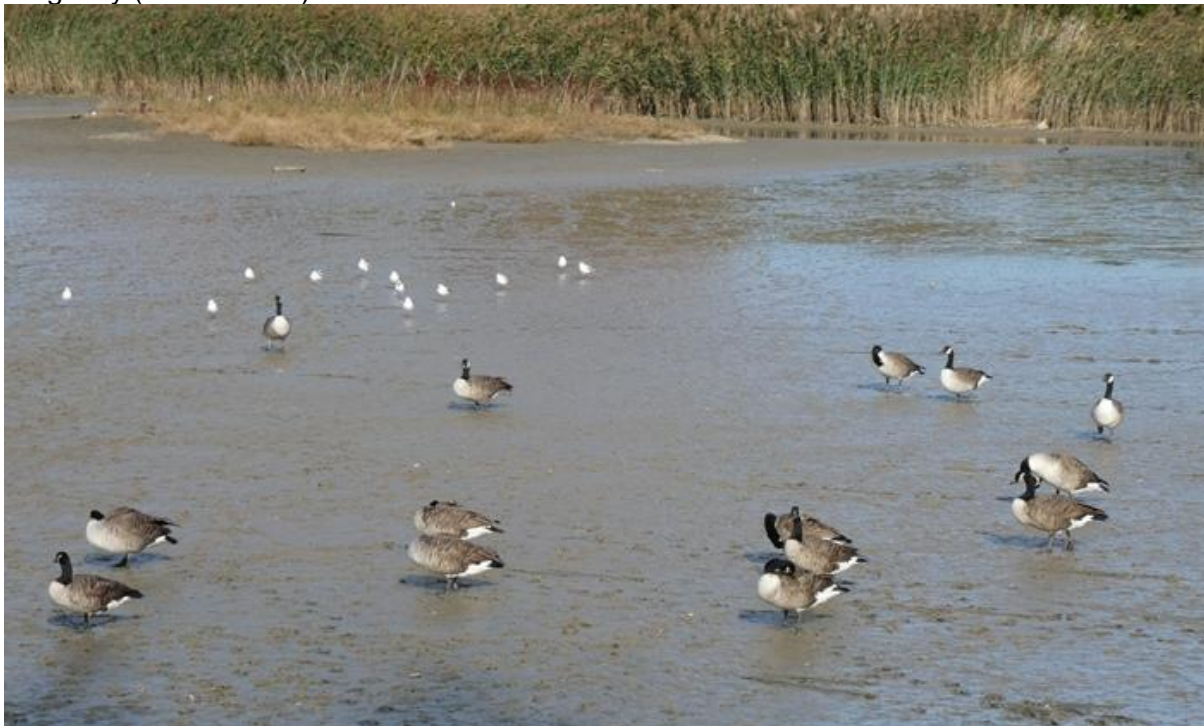
Canada Geese at East India Dock Basin (John Archer)

7 October 2022, East India Dock Basin: a count for the Wetland Bird Survey recorded 3 Little Egrets, 5 Egyptian Geese, 16 Canada Geese (an unusually high count), 2 Mute Swans, 46 Teal, 28 Mallards, 1 Grey Heron, 1 Coot, 9 Moorhens, 1 Herring Gull and 23 Black-headed Gulls. Also 3 Chiffchaffs, 1 singing Cetti's Warbler, 1 Grey Wagtail and 1 Migrant Hawker dragonfly (John Archer).