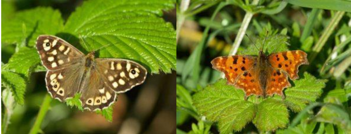
Speckled Wood (left) and Comma at Mudchute (Richard Saville)

20 April 2022, Mudchute: lots of butterflies including 4 Brimstones, 8 Speckled Woods, 3 Commas and 3 Holly Blues. Birds included 2 Swallows flying over, 1 Willow Warbler, 1 Sparrowhawk, 7 Blackcaps, 3 Monk Parakeets, 4 Ringed-necked Parakeets, 4 Blackbirds, 4 Cormorants flying over, 3 Greenfinches, 5 Chiffchaffs and 7 Wrens (Richard Saville). Click photos to enlarge