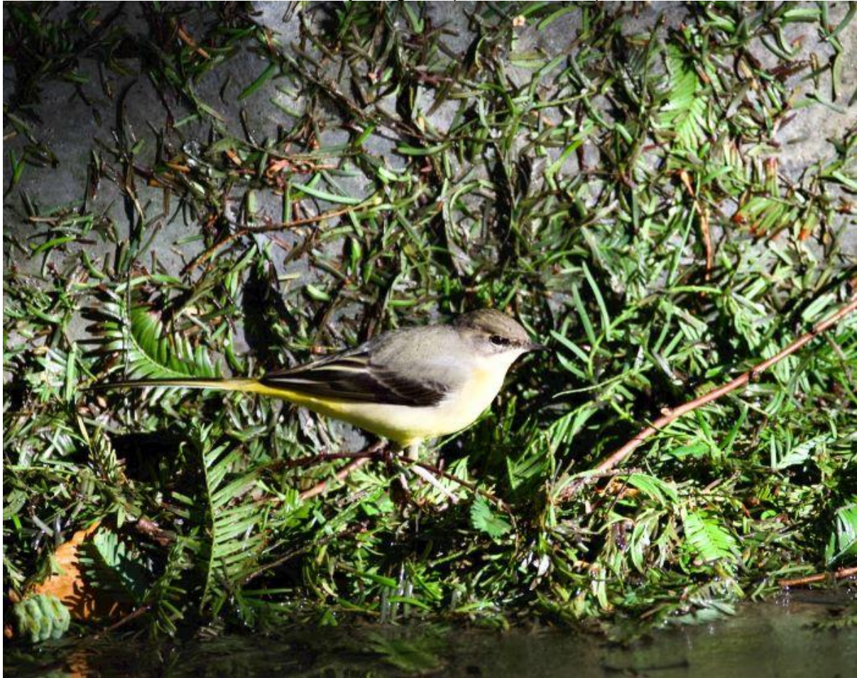
Grey Wagtail in Jubilee Park (Richard Saville)

31 October 2022, Jubilee Park: 2 Grey Wagtails (Richard Saville).