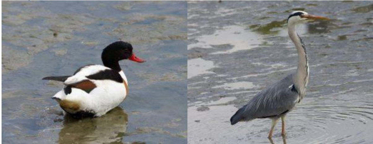
Shelduck (left) and Grey Heron at East India Dock Basin (Richard Saville) click to enlarge

25 April 2022, East India Dock Basin: 1 Grey Heron, 2 Shelducks, 1 Greenfinch (Richard Saville).