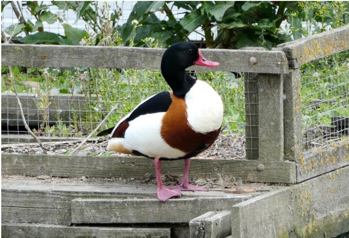
Shelduck at East India Dock Basin (John Archer)

16 May 2022, East India Dock Basin: a count for the Wetland Bird Survey recorded 1 Egyptian Goose, 5 Shelducks, 17 Tufted Ducks, 30 Mallards, 2 Mute Swans, 2 Canada Geese, 1 Coot, 2 Moorhens, 2 Grey Herons and 2 Lesser Black-backed Gulls. Also 3 singing Reed Warblers, 1 singing Blackcap, 1 male Brimstone butterfly and 1 Green-veined White (John Archer).