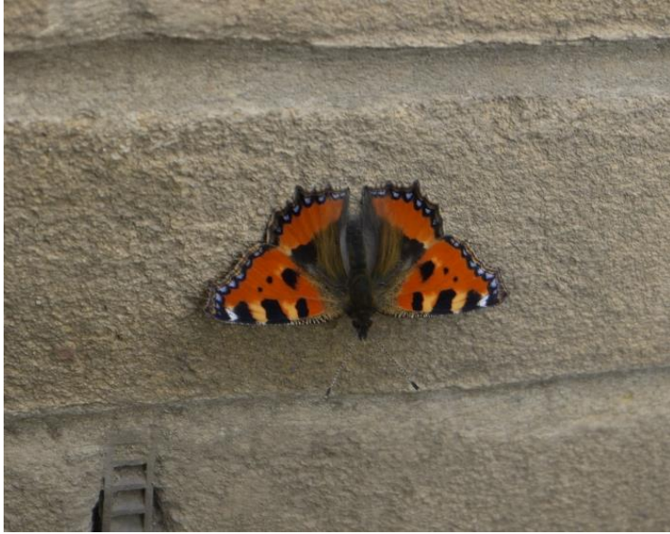
Small Tortoiseshell at Da Gama Place (Harvey Smith)

21 July 2022, Da Gama Place E14: a Small Tortoiseshell butterfly in a front garden (Harvey Smith).