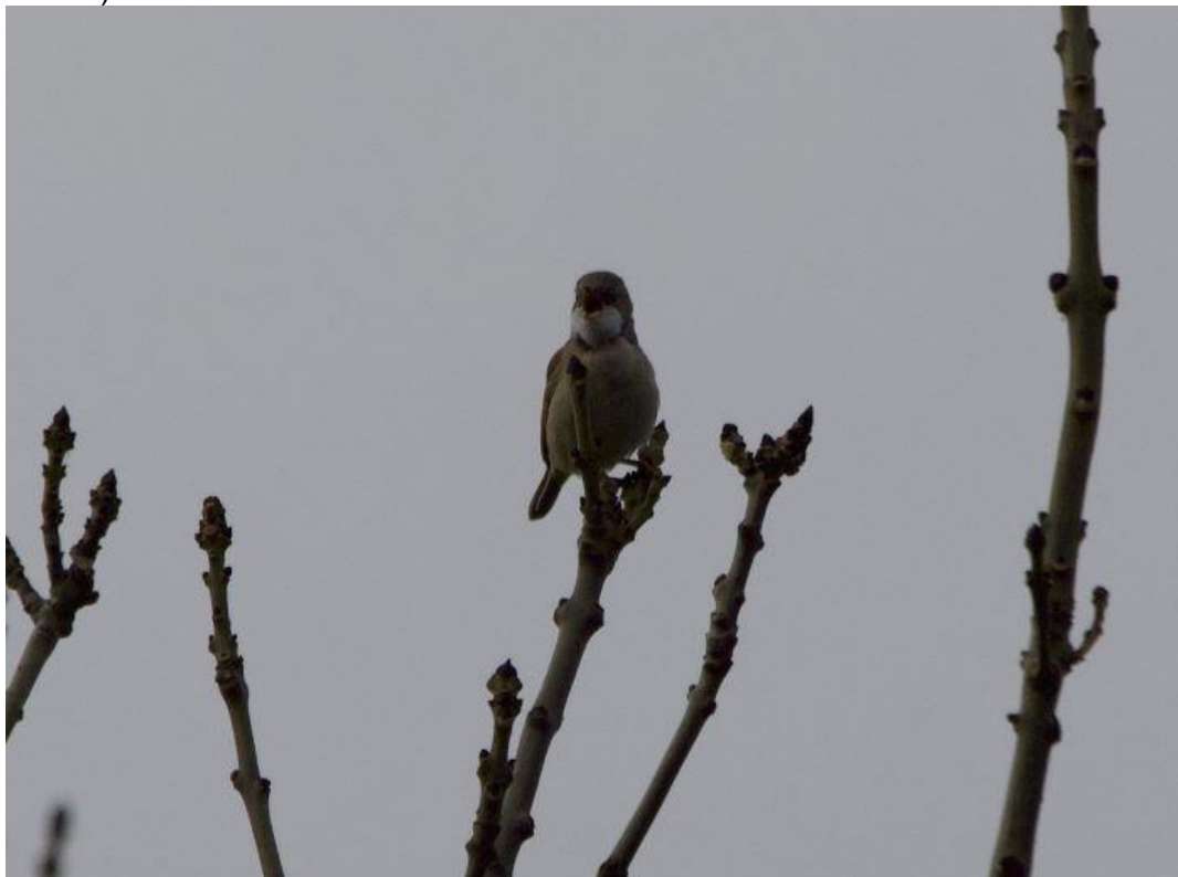
Whitethroat at Mudchute

25 April 2022, Mudchute: a Common Whitethroat singing in the Lower Field.