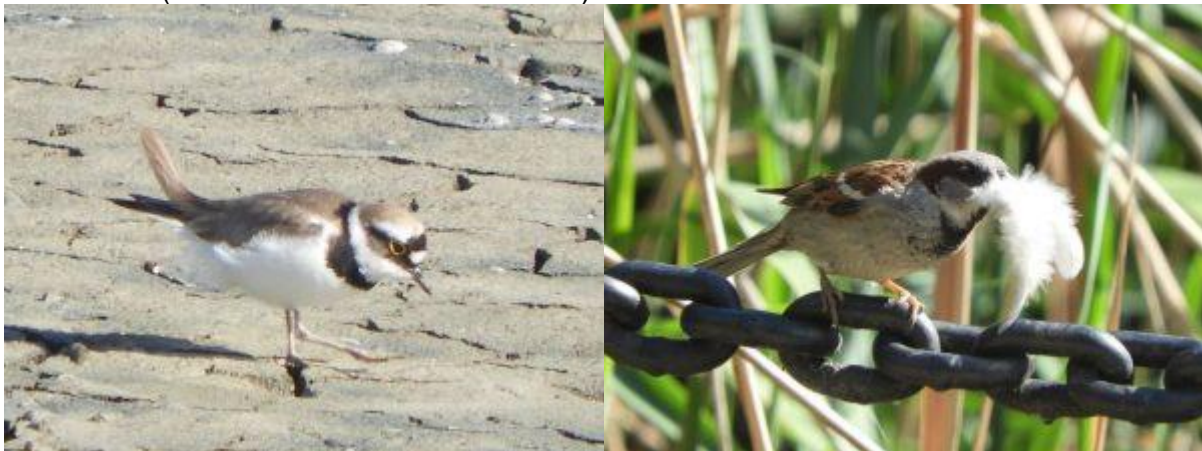
Little Ringed Plover (left) & House Sparrow at East India Dock Basin (Gerald Moore) click to enlarge

27 June 2022, East India Dock Basin: 1 Little Ringed Plover (the first record this year), 1 Common Tern, 2 Mute Swans, 2 Shelducks, 1 Egyptian Goose, 12 Tufted Ducks, 20 Mallards, 40 Black-headed Gulls, 1 Grey Heron, 4 Reed Warblers, 1 Blackcap, 8 Long-tailed Tits, House Sparrows gathering nesting material, 4 Pied Wagtails on the adjacent roundabout (Richard Saville & Gerald Moore).