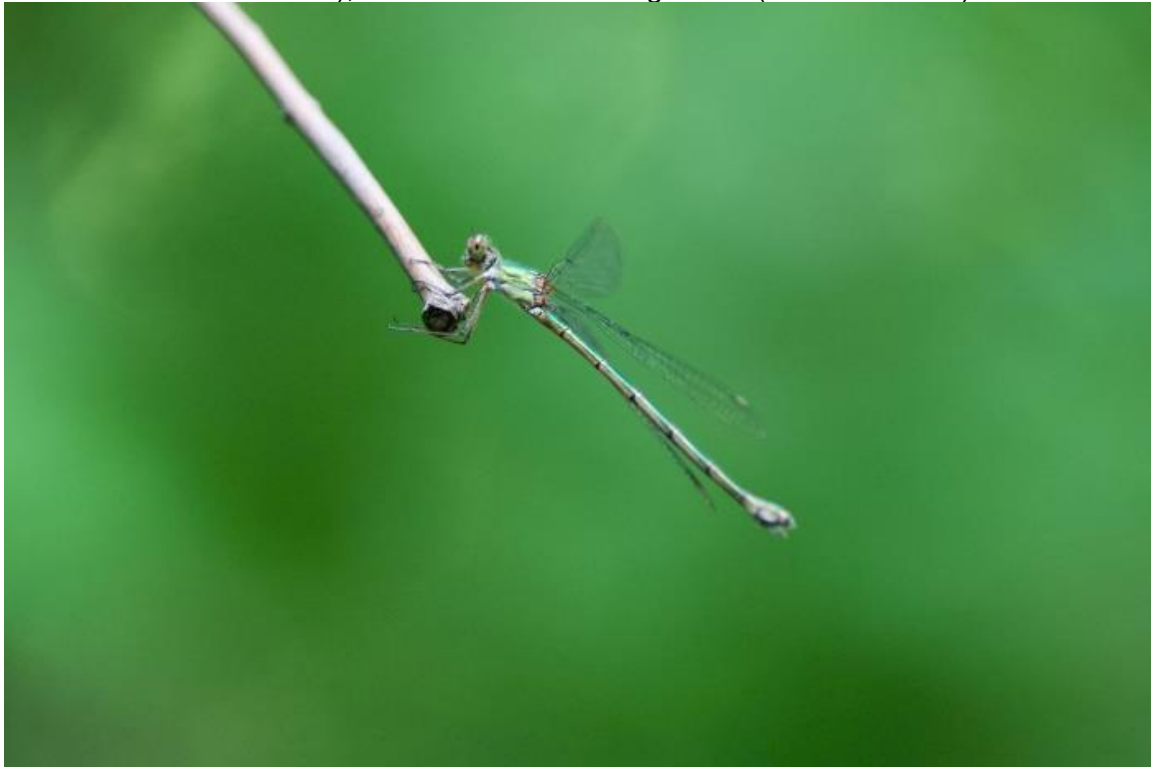
Willow Emerald at Jubilee Park

8 August 2022, Jubilee Park, Canary Wharf: 1 Willow Emerald damselfly (a recent colonist of Britain from the Continent), 2 Common Darter dragonflies.