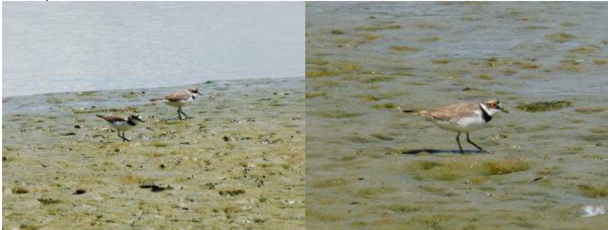
Little Ringed Plovers at East India Dock Basin (John Archer) click to enlarge

5 July 2022, East India Dock Basin: 2 Little Ringed Plovers, 1 Egyptian Goose, 10 Tufted Ducks, 2 Mute Swans, 1 singing Reed Warbler, 1 Red Admiral (John Archer & Richard Saville).