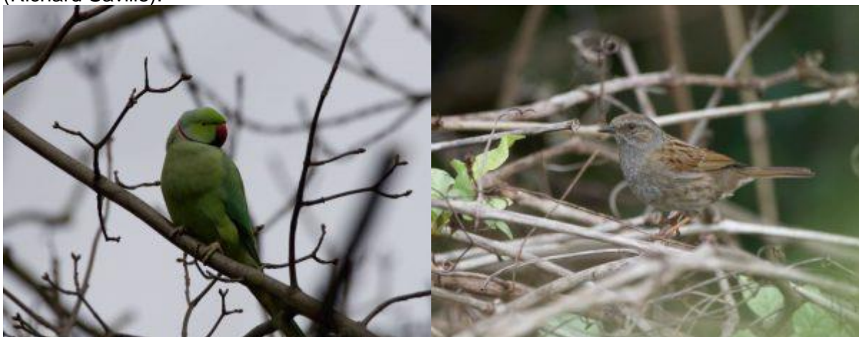
Ring-necked Parakeet (left) and Dunnock at Mudchute (Richard Saville) click to enlarge

6 April 2022, Mudchute: 3 Monk Parakeets, 2 Ring-necked Parakeets, 5 Blackcaps, 1 Great Spotted Woodpecker, 5 Robins, 2 Dunnocks, 2 Greenfinches, 2 Blackbirds, 6 Wrens (Richard Saville).