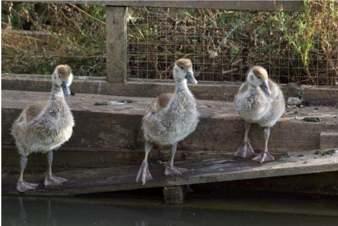
Egyptian Goose goslings at East Indian Dock Basin (Richard Saville)

31 August 2022, East India Dock Basin: an Egyptian Goose with 3 goslings, 12 Teal, 1 Cetti's Warbler, 2 Reed Warblers (Richard Saville).