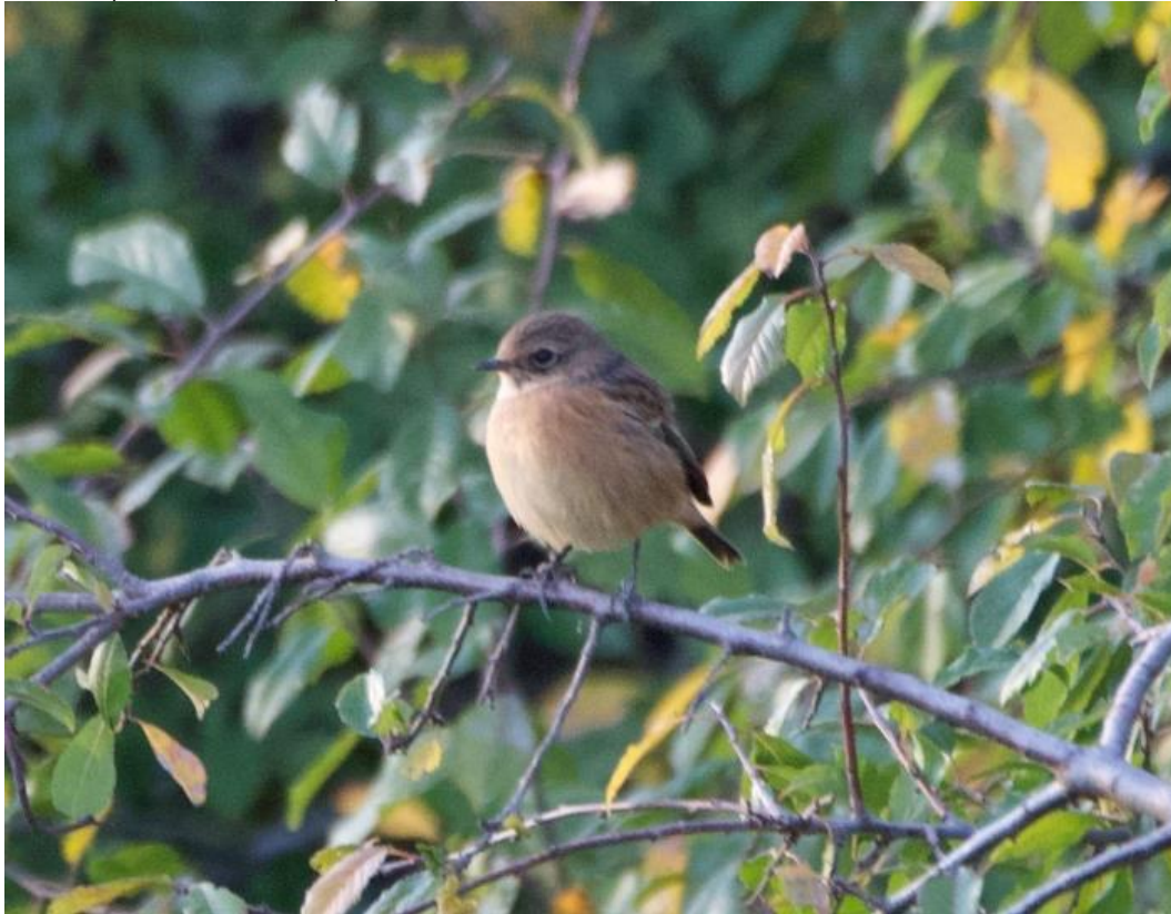
Stonechat at East India Dock Basin (Richard Saville)

29 September 2022, East India Dock Basin: 1 Stonechat, probably only the second ever site record (Richard Saville).