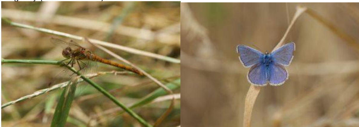
Common Darter (left) and Common Blue at Mudchute click to enlarge