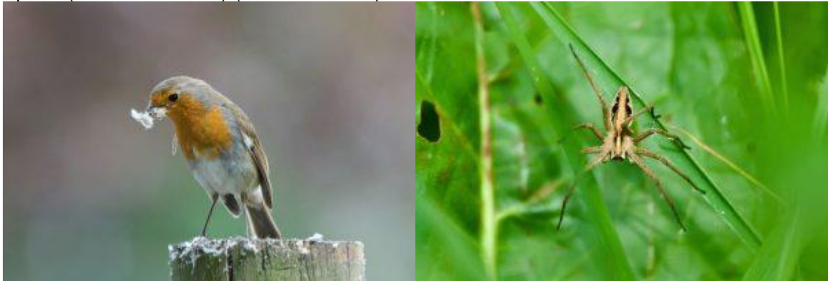
Robin (left) and Nursery Web Spider at Mudchute (Richard Saville) click to enlarge

9 May 2022, Mudchute: a Robin collecting nest bedding, 2 Long-tailed Tits with 3 fledglings, 1 Brimstone butterfly, 7 Speckled Woods, 3 Small Whites, 2 Holly Blues, 1 Nursery Web Spider ( Pisaura mirabilis ) (Richard Saville).