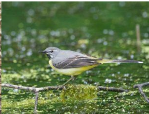
Small Tortoiseshell (left) and Grey Wagtail at Mudchute (Richard Saville) click to enlarge