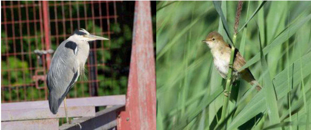
Grey Heron (left) & Reed Warbler at East India Dock Basin click to enlarge