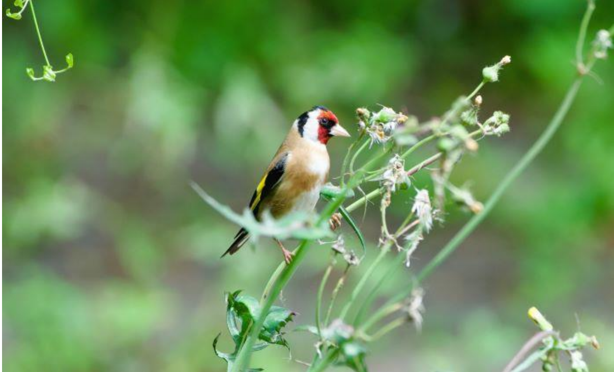
Goldfinch at East India Dock Basin (Richard Saville)

26 May 2022, East India Dock Basin: 3 Shelducks, 3 Goldfinches, 4 Long-tailed Tits, 1 Grey Heron, 1 Cormorant, 1 Black-headed Gull, 2 Reed Warblers (Richard Saville).