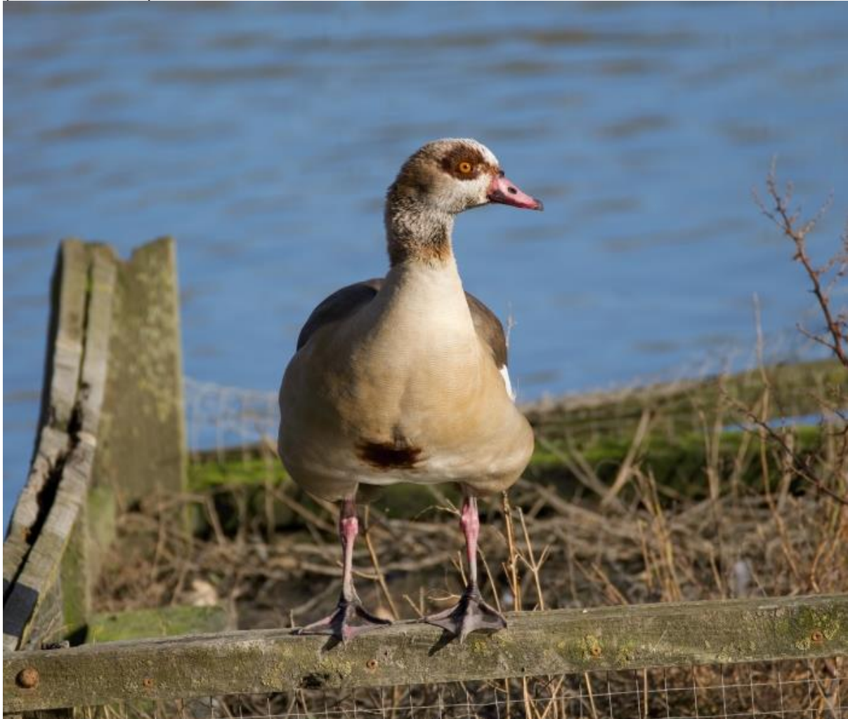
Egyptian Goose at East India Dock Basin (Richard Saville)

22 November 2022, East India Dock Basin: 1 Kingfisher, 1 Reed Bunting, 3 House Sparrows, 1 Grey Wagtail, 4 Shelduck, 1 Grey Heron, 1 Egyptian Goose, 1 Cetti's Warbler (Richard Saville).