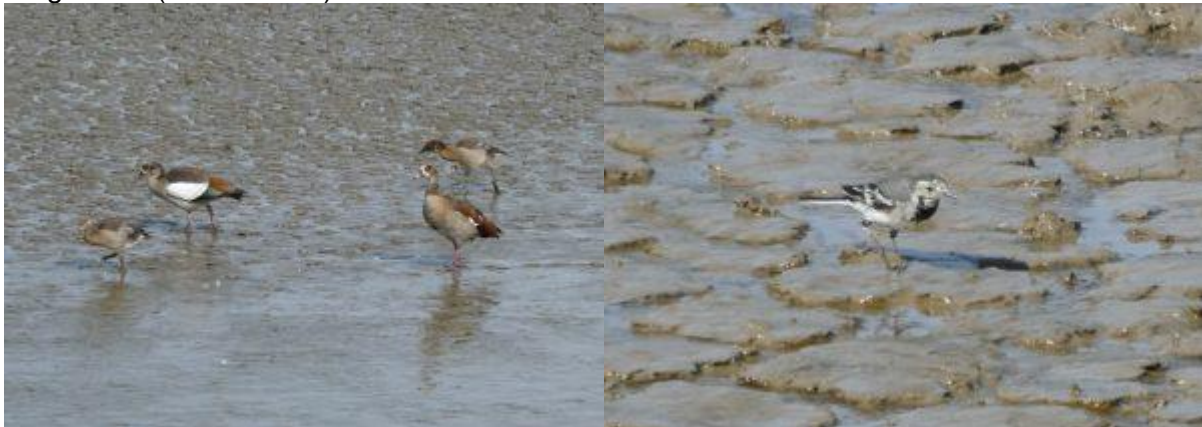
Egyptian Goose family (left) and Pied Wagtail at East India Dock Basin (John Archer) click to enlarge

12 September 2022, East India Dock Basin: a count for the Wetland Bird Survey recorded 32 Teal, 46 Mallards, 5 Egyptian Geese (a pair with 2 goslings and an additional adult), 7 Canada Geese, 2 Mute Swans, 6 Moorhens, 1 Grey Heron, 116 Black-headed Gulls and 3 Herring Gulls. Also 2 Pied Wagtails, a singing Cetti's Warbler and 3 Migrant Hawker dragonflies (John Archer).