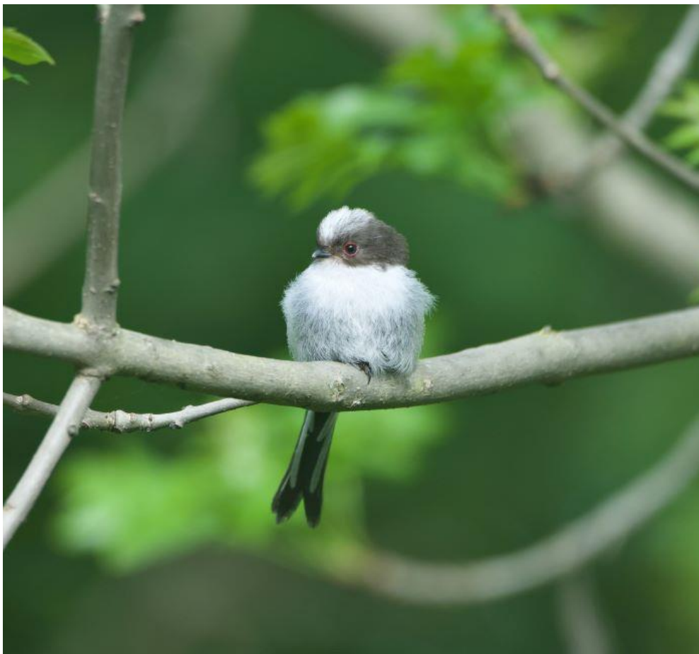
Long-tailed Tit at Mudchute

1 May 2022, Victoria Park: a Nuthatch on East Lake island.