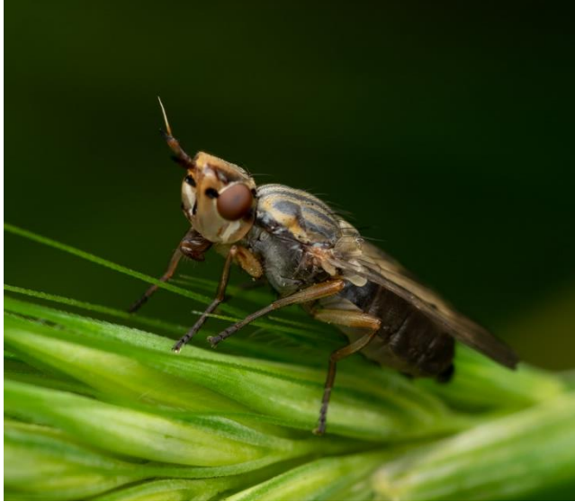
Phoenix Fly at Weavers Fields (Gino Brignoli)

18 May 2022, Weavers Fields: a Phoenix Fly ( Dorycera graminum ), a nationally scarce picture-winged fly (Gino Brignoli). See this News post for more details of this exciting record.