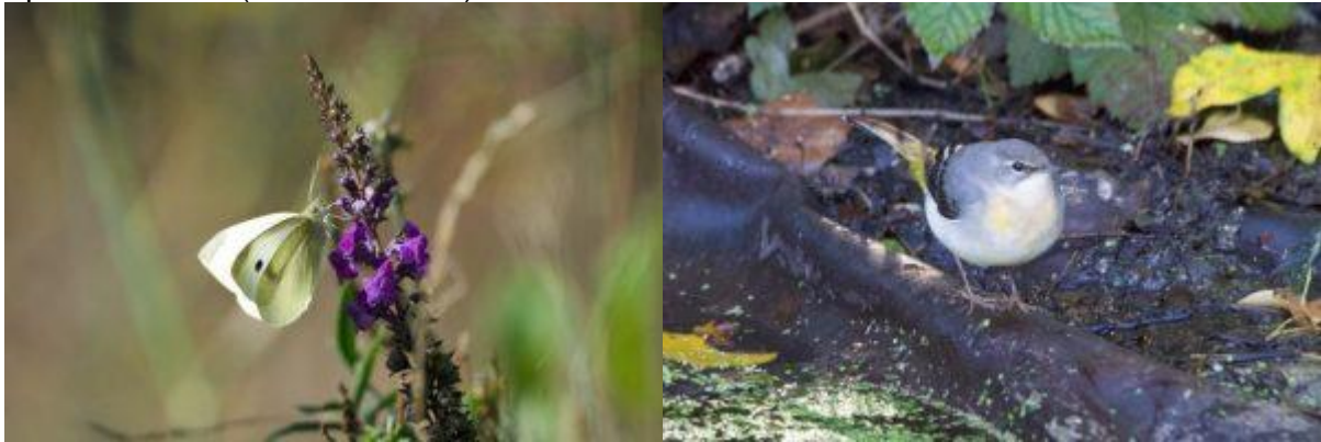
Small White (left) and Grey Wagtail at Mudchute (Richard Saville) click to enlarge

11 October 2022, Mudchute: 2 Monk Parakeets, 1 Grey Wagtail, 3 Small White butterflies, 1 Speckled Wood (Richard Saville).