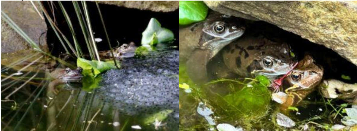
Common Frogs spawning at Approach Gardens (Sam van Rood) click to enlarge

18 March 2022, Approach Gardens: lots of Common Frogs spawning in the ponds (Sam van Rood).