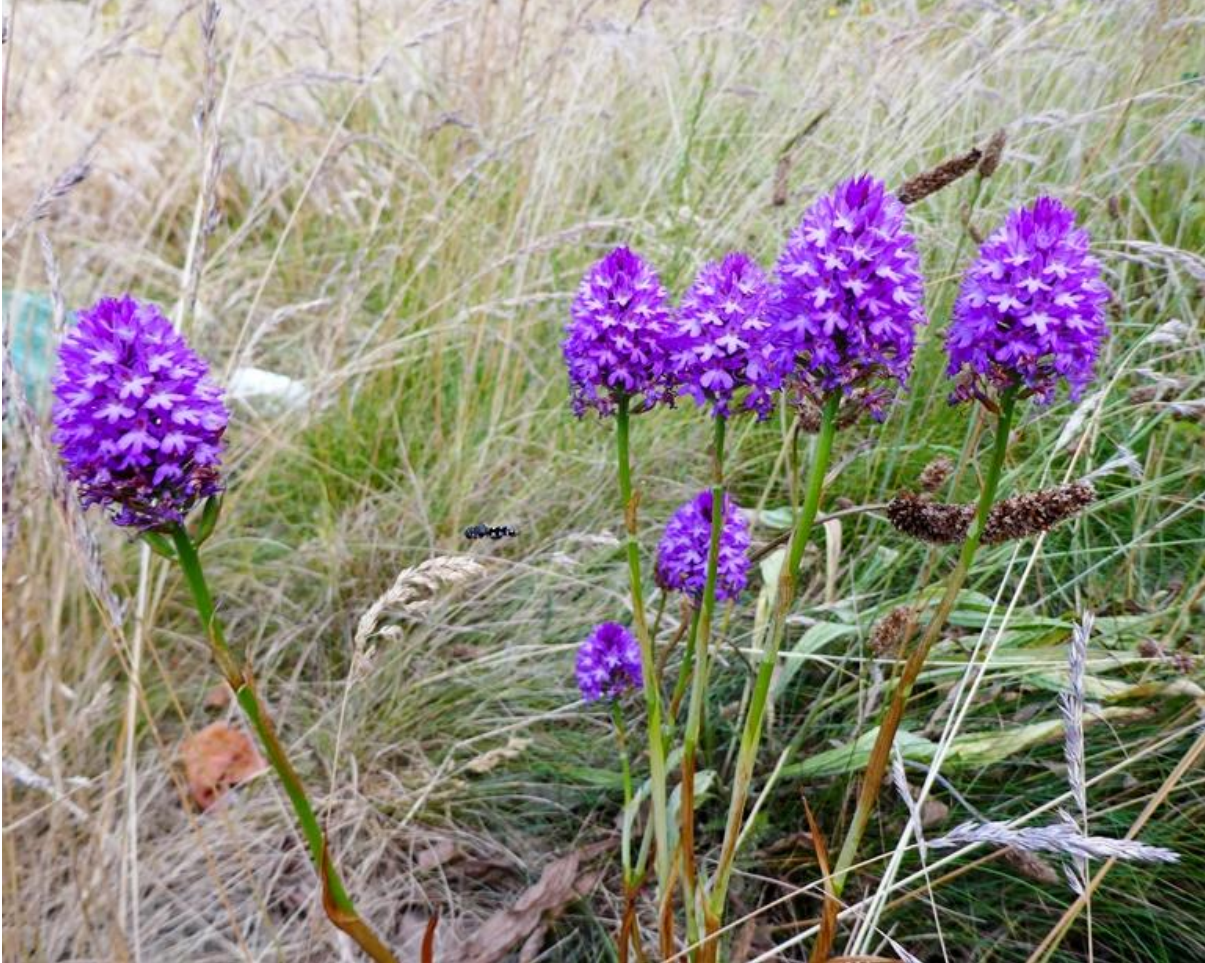
Pyramidal Orchids on A13 verge (John Archer)

20 June 2022, A13 verge, Poplar: 7 spikes of Pyramidal Orchid in full flower (John Archer).