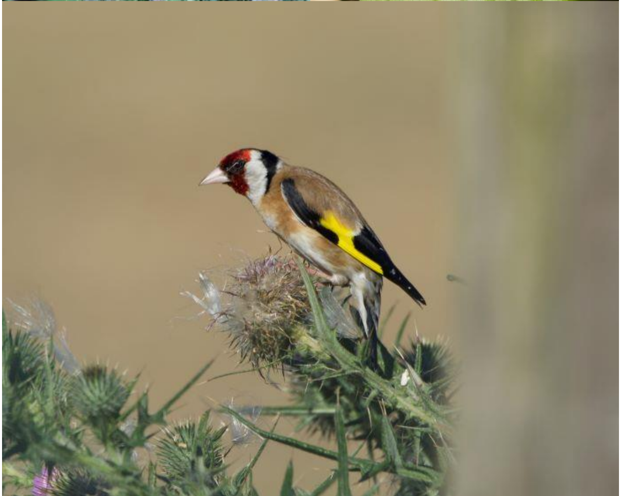
Song Thrush (top left), Large Skipper (top right) and Goldfinch at Mudchute click small photos to enlarge

2 July 2022, Cranbrook Community Food Garden: 1 Brown Hawker dragonfly.