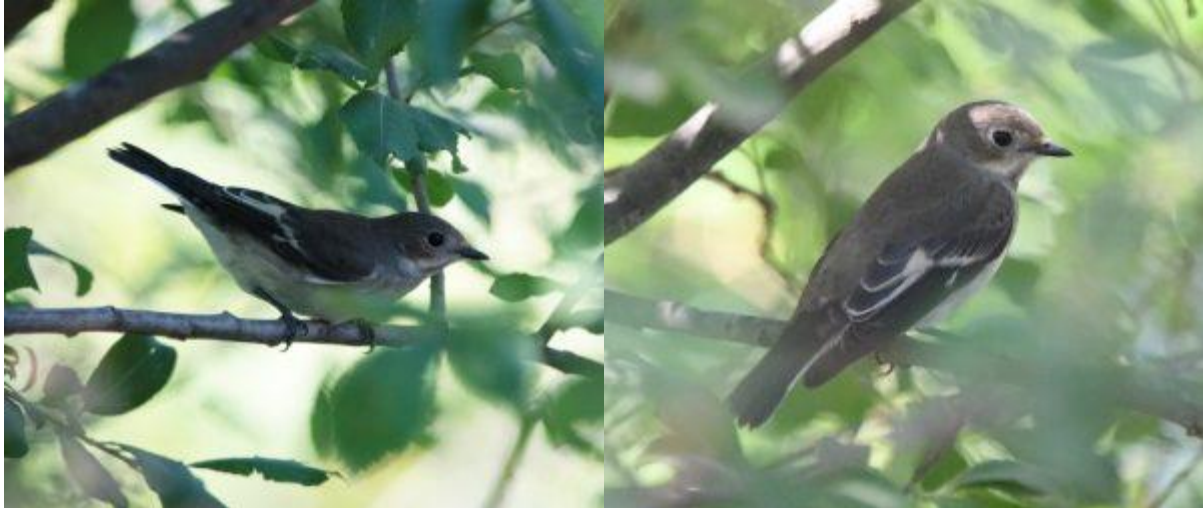
Pied Flycatcher at Victoria Park (David Darrell-Lambert) click to enlarge

13 August 2022, Victoria Park: a guided bird walk recorded 38 species of birds, including a Pied Flycatcher by the Chinese Pagoda, 1 Kestrel, 1 Sparrowhawk, 1 Gadwall, 2 Pochards, 4 Little Grebes (with young on both East and West Lakes), a pair of Great Crested Grebes with 1 large young on West Lake, 3 Tufted Ducks, 1 hybrid Bar-headed x White-fronted Goose (not Bar-headed x Greylag as previously reported), 30 Greylag Geese, 22 Canada Geese, 1 Coal Tit, 1 Nuthatch, 3 Blackcaps, 1 Goldcrest, 1 Great Spotted Woodpecker, 1 Grey Wagtail and 2 Stock Doves. Also 3 Willow Emerald damselflies by East Lake (David Darrell-Lambert and the Bird Barmy Army).