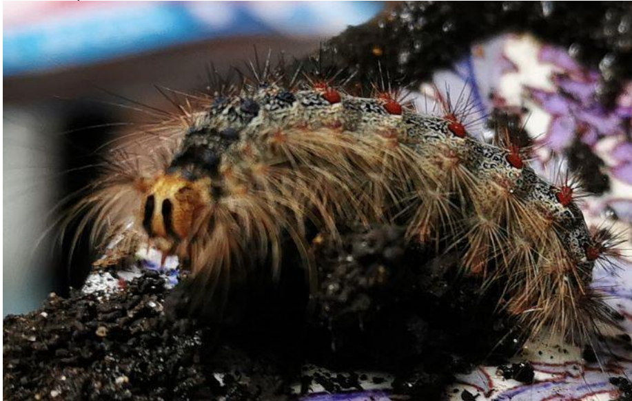
Gypsy Moth caterpillar at Hesperus Crescent (Peter Minvalla)

6 July 2022, Hesperus Crescent E14: a Gypsy Moth caterpillar in a garden (Melanie Minvalla).