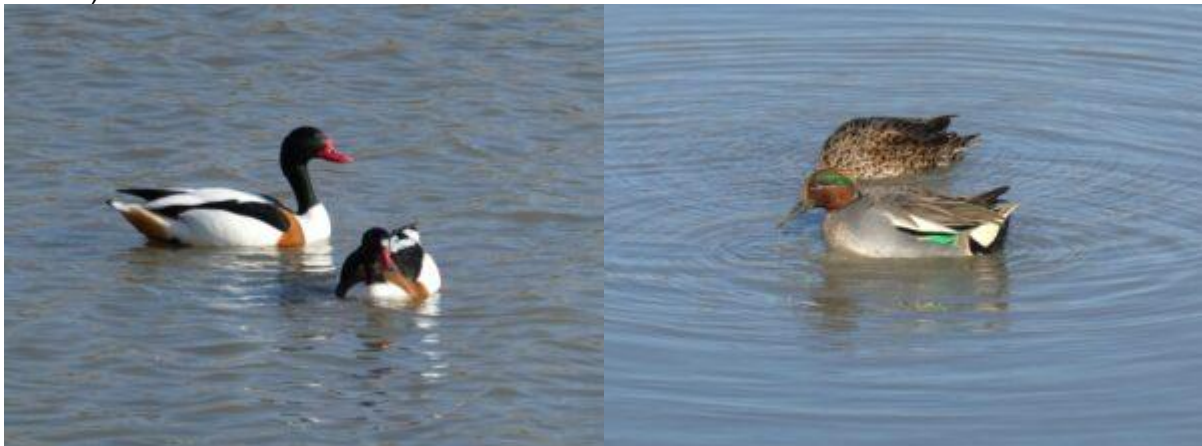
Shelducks (left) and Teal at East India Dock Basin (John Archer) click to enlarge

19 March 2022, East India Dock Basin: a count for the Wetland Bird Survey recorded 8 Shelducks, 37 Teal, 1 Common Gull, 1 Lesser Black-backed Gull, 2 Black-headed Gulls, 2 Mute Swans, 15 Mallards and 4 Moorhens. Also at least 4 Greenfinches singing (John Archer).