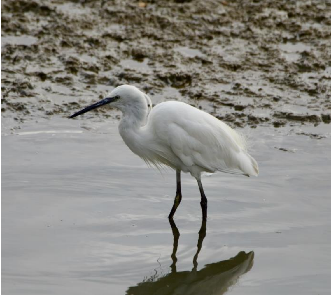
Little Egret at East India Dock Basin (Richard Saville)

27 July 2022, East India Dock Basin: 1 Little Egret, 1 Grey Wagtail (Richard Saville).