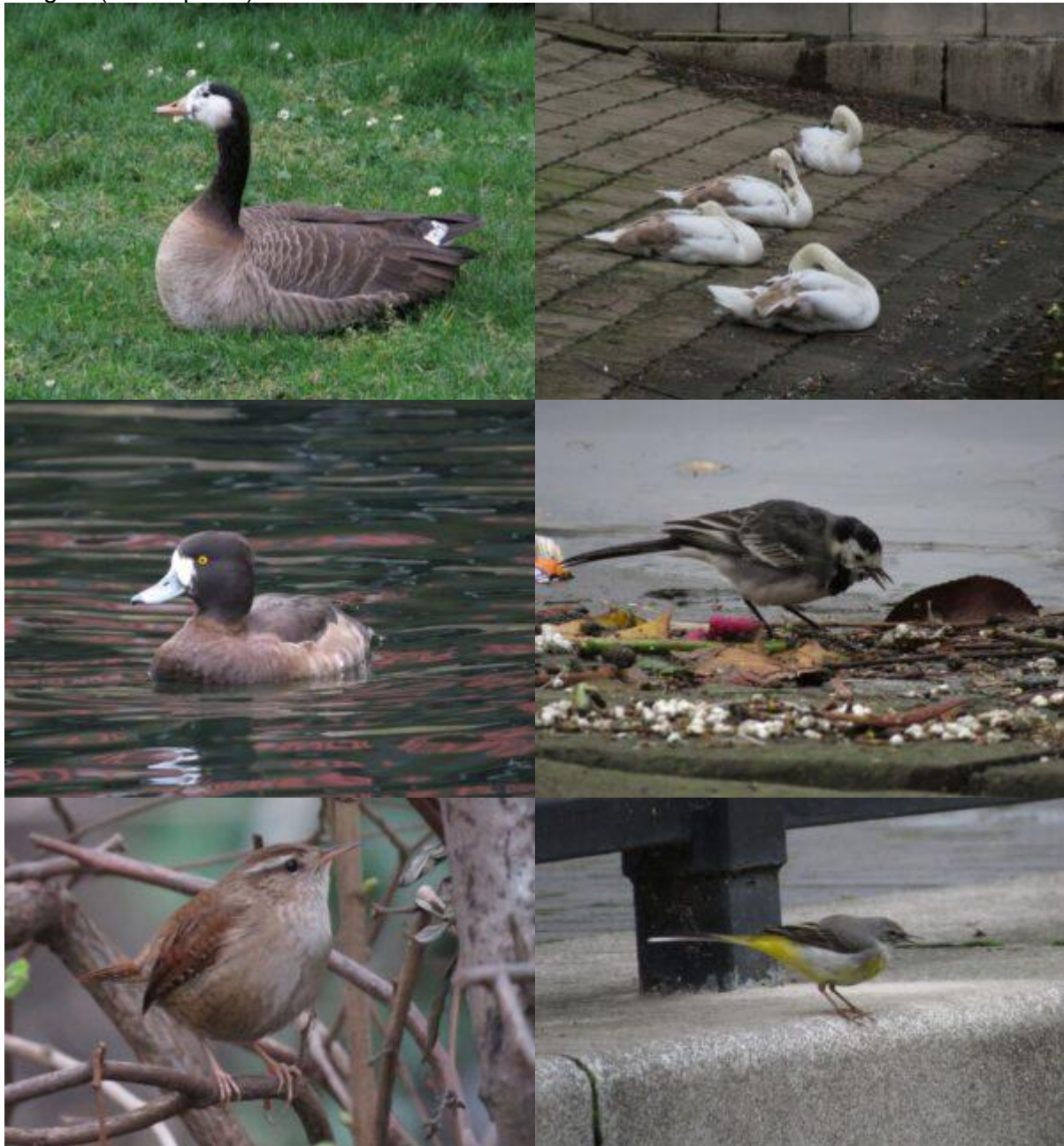
Clockwise from top left: Canada x Greylag Goose hybrid, Mute Swans, Tufted Duck, Pied Wagtail, Grey Wagtail and Wren at Poplar Dock (Tom Speller) click to enlarge

16 February 2022, Poplar Dock Marina: 14 Coots, 2 Moorhens, 23 Mallards, 10 Tufted Ducks, a pair of Mute Swans with 4 of last year's young, 1 Canada x Greylag Goose hybrid, 7 Canada Geese, 2 Great Crested Grebes, 4 Great Tits, 1 Wren, 1 Grey Wagtail, 1 Pied Wagtail (Tom Speller).