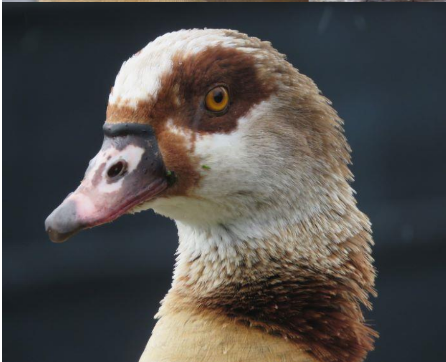
Egyptian Geese at Poplar Dock click to enlarge