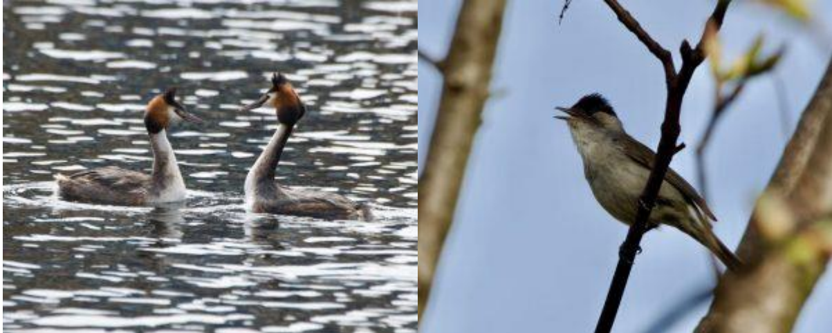
Great Crested Grebes (left) and Blackcap at Poplar Dock Marina (Richard Saville) click to enlarge

12 April 2022, Poplar Dock Marina: 3 Blackcaps, 1 Ring-necked Parakeet, 2 Great Crested Grebes, 7 Tufted Ducks, 2 Egyptian Geese, 4 Canada Geese, 1 Cormorant, 2 Grey Wagtails, 20+ House Sparrows, 3 Dunnocks, 4 Blackbirds, 2 Robins, 3 Wrens, 6 Goldfinches, 3 Starlings, 4 Magpies, 1 Small White butterfly (Richard Saville).