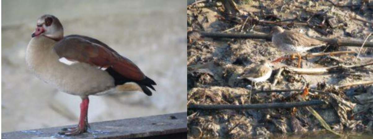
Egyptian Goose (left), Redshank (rear right) & Common Sandpiper (front right) at Bow Creek (Tom Speller)

8 March 2022, Bow Creek: 1-2 Common Sandpipers, 1 Redshank, 1 Shelduck flew over south, 1 Egyptian Goose, c50 Teal, 2 singing Cetti's Warblers, 2 Song Thrushes, 1 singing Greenfinch (Tom Speller). Click photos to enlarge