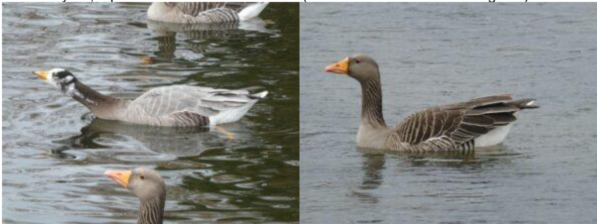
Bar-headed x Greylag Goose hybrid (left) and Greylag Goose (John Archer) click to enlarge

10 February 2022, Victoria Park (West Lake): 25 Shovelers, 7 Pochards, c30 Tufted Ducks, 1 hybrid Bar-headed x Greylag Goose, 5+ adult Egyptian Geese including a pair with 10 small goslings, 8+ Greylag Geese, 10+ Canada Geese, a pair of Mute Swans with 4 young from last year, a pair of Great Crested Grebes (John Archer & Lizzie Buckingham).