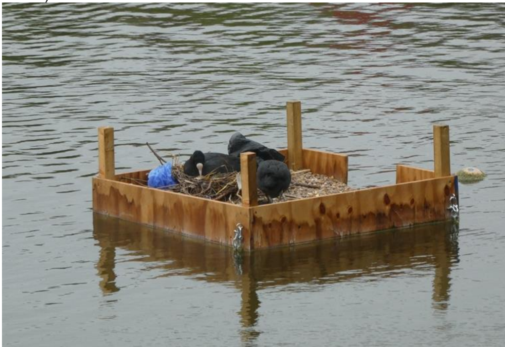
Coots nesting on a raft (John Archer)

10 May 2022, Shadwell Basin: 2 pairs of Coots nesting (one pair on one of the new bird rafts), a pair of Mute Swans nesting, 4 Tufted Ducks, 2 Egyptian Geese, 2 Cormorants (John Archer).