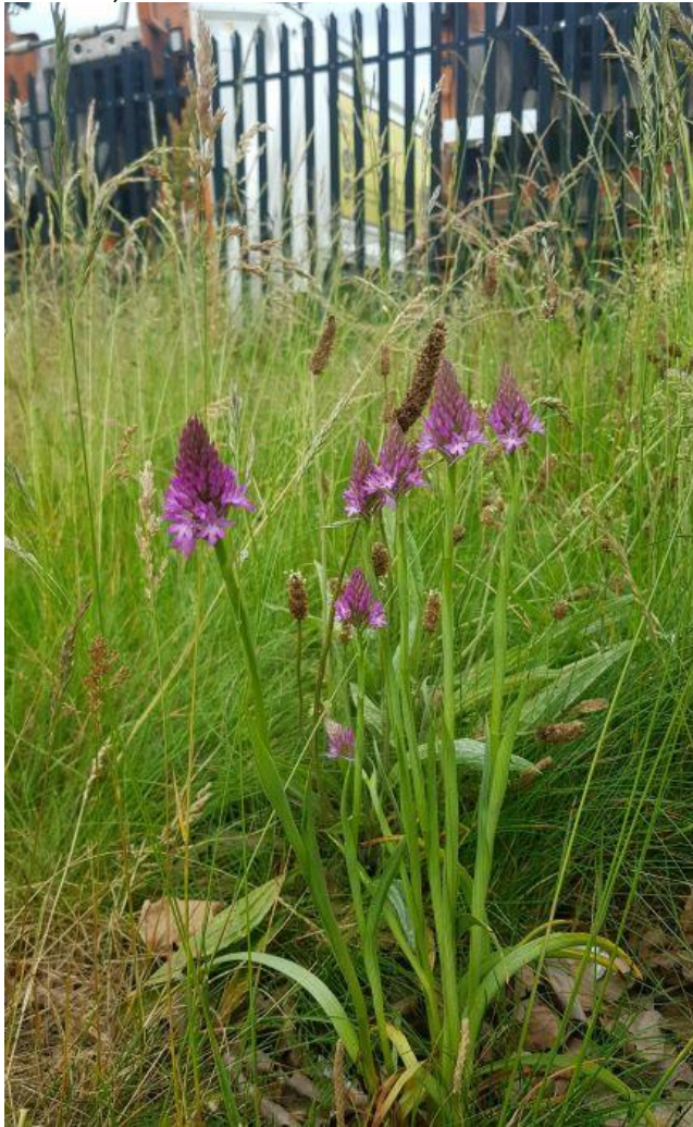
Pyramidal Orchids on the A13 verge (Peter Massini)

9 June 2022, A13 verge, Poplar: several Pyramidal Orchids just starting to flower (Peter Massini).