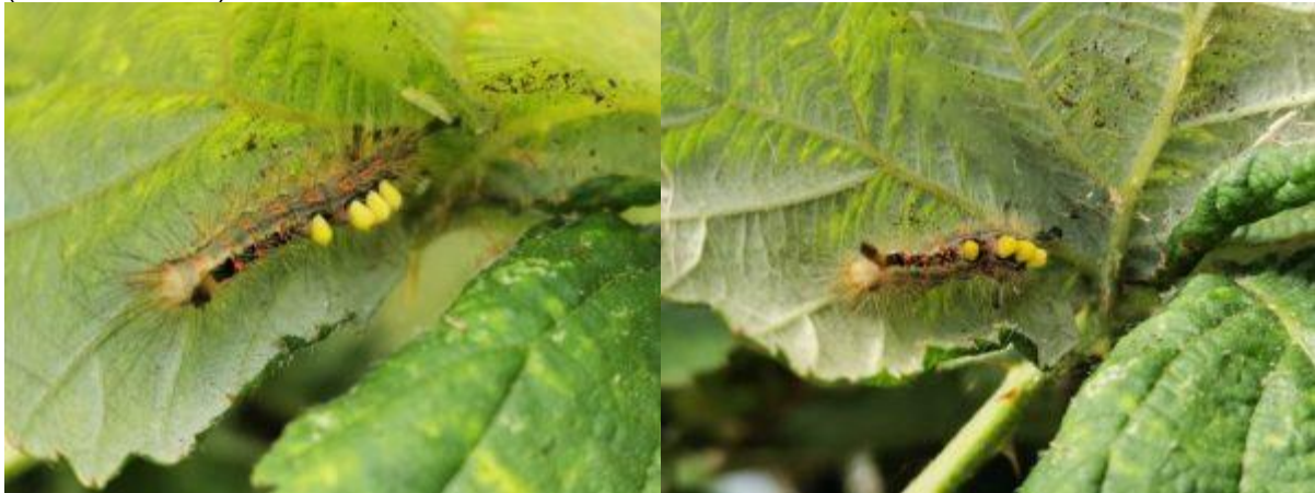
Vapourer Moth caterpillar (Peter Minvalla) click to enlarge

28 June 2022, Millwall Slipway: a Vapourer Moth caterpillar in brambles by the river entrance (Peter Minvalla).