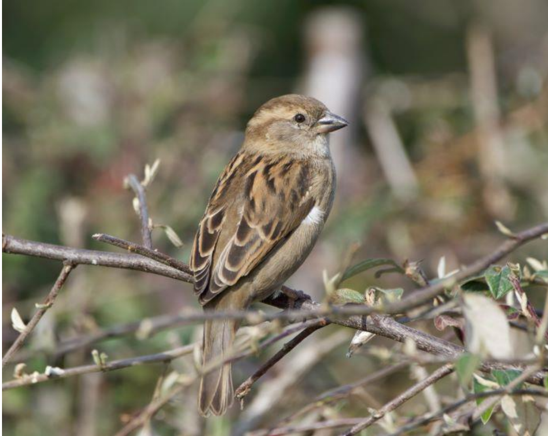
House Sparrow at Poplar Dock Marina

22 March 2022, Poplar Dock Marina: House Sparrows nest-building in the hedges.