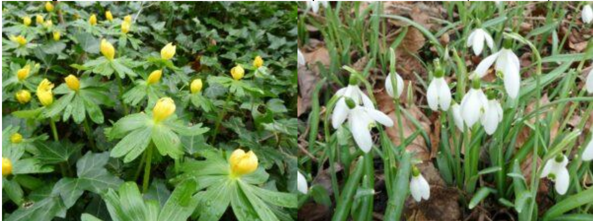
Winter Aconite (left) and Snowdrops at Bethnal Green NR click to enlarge