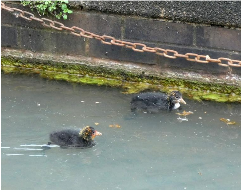
Coot chicks at Tobacco Dock (John Archer)

10 May 2022, Wapping Canal (Tobacco Dock section): 3 pairs of Coots (2 with 3 chicks each, the third nest-building), 3 pairs of Moorhens, 5 Mallards, Yellow Iris in flower (John Archer).