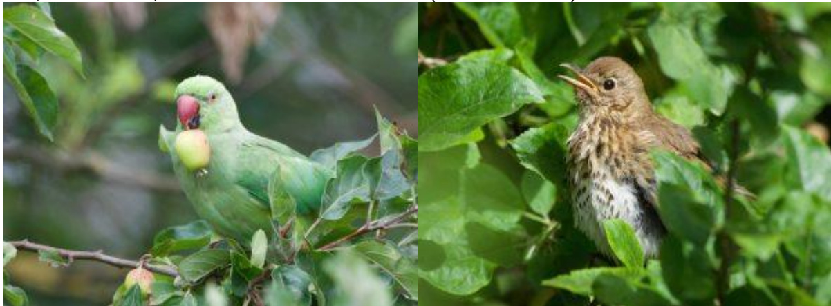
Ring-necked Parakeet (left) and Song Thrush at Mudchute (Richard Saville) click to enlarge

3 August 2022, Mudchute: 6 Ring-necked Parakeets feeding on crab apples by the main compound, lots of birds and butterflies feeding and drinking around a nearly-dry pond in the Lower Field, including 7 Blackbirds, 2 Grey Wagtails, 1 Chiffchaff, 1 Song Thrush, 3 Blue Tits, 2 Great Tits, 4 Wrens and 5 Red Admirals (Richard Saville).