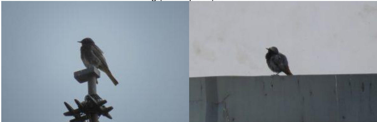
Black Redstart at West India Quay (Tom Speller) click to enlarge

13 July 2022, West India Docks: a male Black Redstart singing around West India Quay in the morning, a female Tufted Duck with 2 ducklings and a female Mallard with 2 ducklings on North Dock near the Crossrail building (Tom Speller).