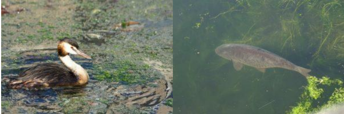
Great Crested Grebe (left) and Carp at Blackwall Basin (Richard Saville) click to enlarge

16 August 2022, Blackwall Basin: 1 Great Crested Grebe, 2 large Carp (Richard Saville).