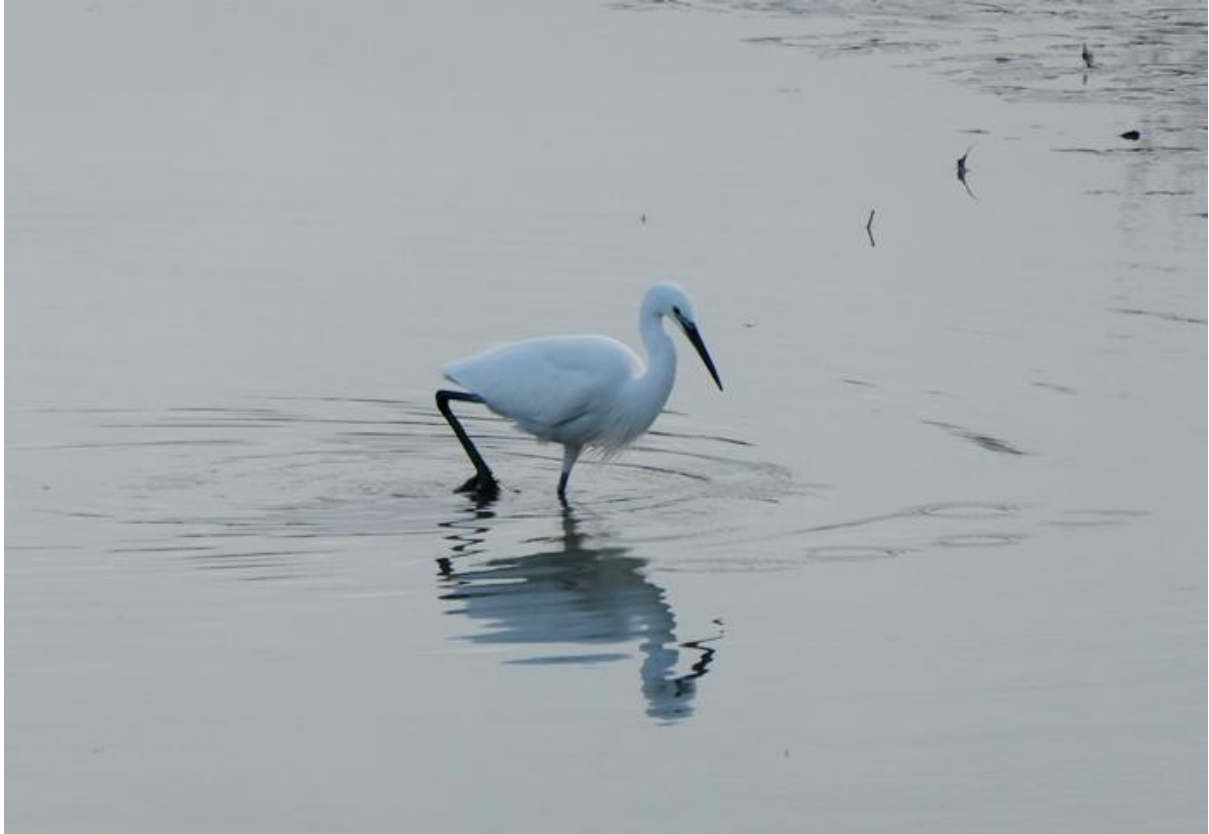
Little Egret at East India Dock Basin (John Archer)

2 December 2022, East India Dock Basin: 1 Little Egret, 17 Teal, 2 Mute Swans, 2 Canada Geese, 42 Mallards (John Archer).