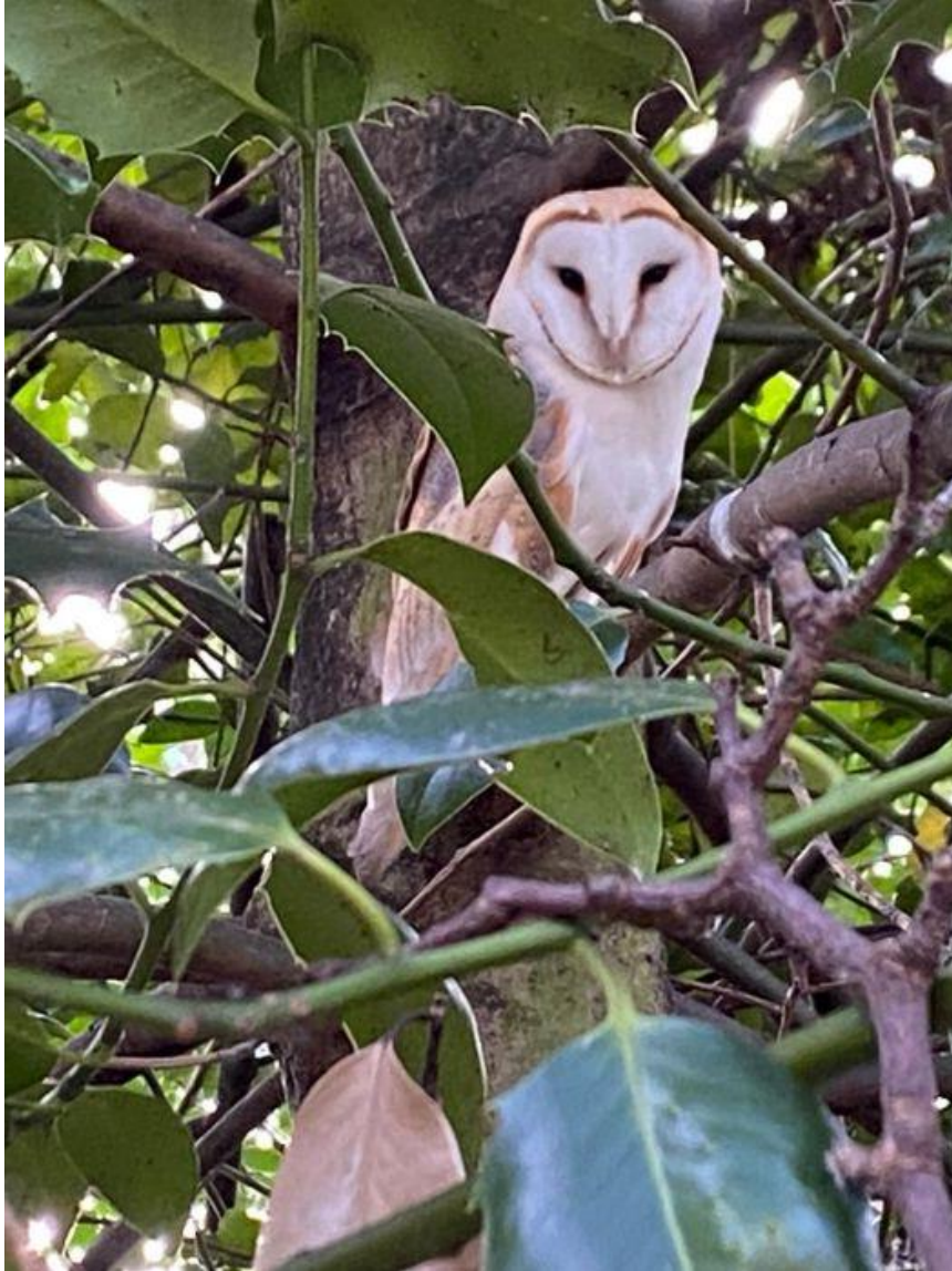
Barn Owl in Tower Hamlets Cemetery Park (Bernie)

9 February 2022, Tower Hamlets Cemetery Park: a Barn Owl on the eastern side of the park – photo and more information on Twitter . This is a very unusual sighting, as Barn Owls are not normally seen in inner London. It may possibly be an escaped captive bird (Bernie per Friends of Tower Hamlets Cemetery Park).